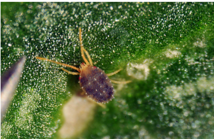
Clover mite