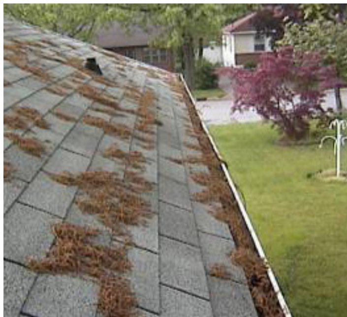
Improperly maintained gutters are habitats for nuisance and vector mosquitoes.

The most effective control of mosquitoes around the home is to prevent them from breeding. This can be done by eliminating or altering existing breeding sites as follows: