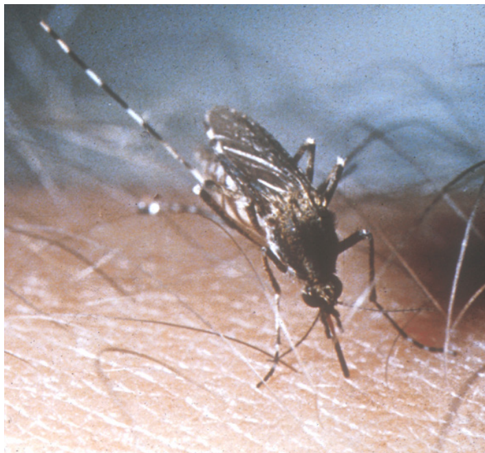
Female mosquito feeding.

Mosquito-borne viruses that have been of concern in Indiana include those that are responsible for causing such diseases as St. Louis Encephalitis, La Crosse fever, Eastern equine encephalitis, Western equine encephalitis, and West Nile virus. Wild birds serve as the reservoir. Mosquitoes feed on infected birds and transmit the virus to other birds. The virus becomes widespread in the wild bird population by midsummer, when mosquitoes are abundant. Some mosquitoes may become infected and transmit the virus to non-bird hosts such as people and horses between July and late October.