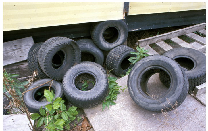
Old discarded tires are a breeding ground for mosquitoes.

Mosquitoes always develop in water, but the type of breeding place varies with the species of mosquito. Common breeding places are flood waters, woodland pools, slow-moving streams, ditches, marshes, and around the edges of lakes. Other mosquitoes develop in tree cavities, rain barrels, fish ponds, bird baths, old tires, tin cans, guttering, catch basins or any container that holds water. Diseases such as West Nile virus and Zika are transmitted by these container breeding mosquitoes.