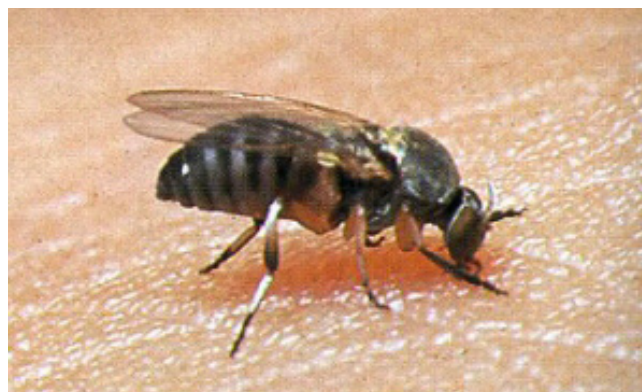
Female black fly taking a blood meal

Black flies range in size from 5 to 15 mm, and they are relatively robust, with an arched thoracic region (Figure 1). They have large compound eyes, short antennae, and a pair of large, fan-shaped wings. Most species have a black body, but yellow and even orange species exist.