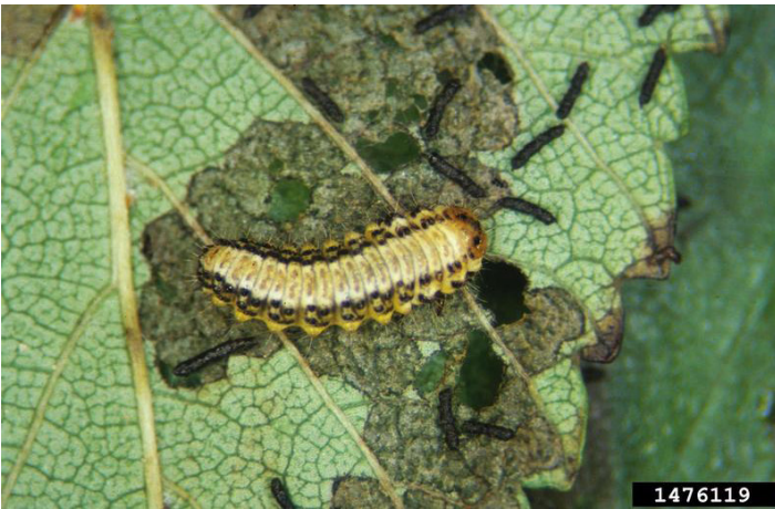
Elm leaf beetle larva.

this disease, the elm bark beetle, which will attack weakened trees, does. Even without secondary attack by other insect and disease pests, repeated elm leaf beetle damage may eventually weaken trees to the point of death.