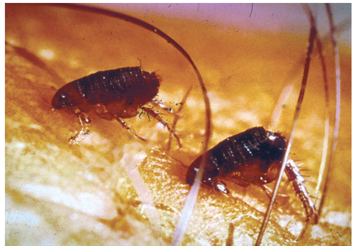
Figure 2. Adult cat fleas feeding.