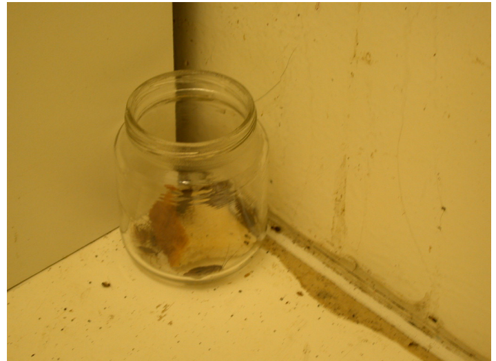
Jar trap baited with bread and beer.

A baby food jar with the inside upper portion lightly greased with petroleum jelly is a simple tool to locate the cockroaches and determine level of infestations. It also helps reduce the number of cockroaches. Place a piece of bread soaked in a small amount of beer in the jar to attract the cockroaches.