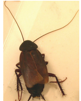
Oriental cockroach.

ally found inside houses is the Oriental cockroach, sometimes called a "water bug" or "water beetle." Its length is about 1-1/4 inches for the female and 1 inch for the male. It is dark brown in color.