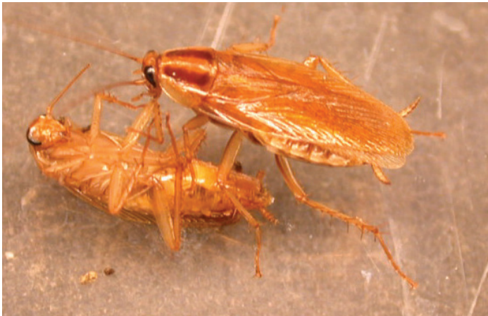
German cockroach (Note the two dark stripes behind the head).

The cockroach is one of the most common urban pests found in human dwellings all over the world, especially in multi-family housing units. Many people feel frustrated or do not know how to properly get rid of cockroaches. Here, we provide some basic information about cockroaches and simple steps to eliminate cockroach infestations.