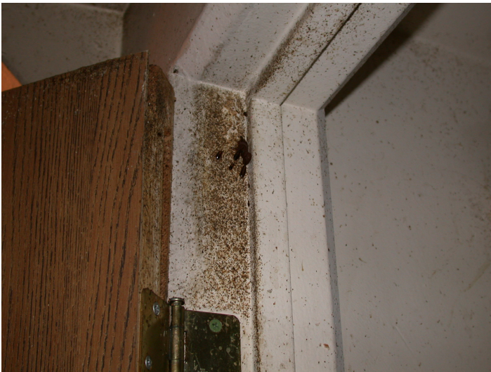
Signs of heavy cockroach infestations.

All of these procedures are essential to maintain a cockroach-free living environment.