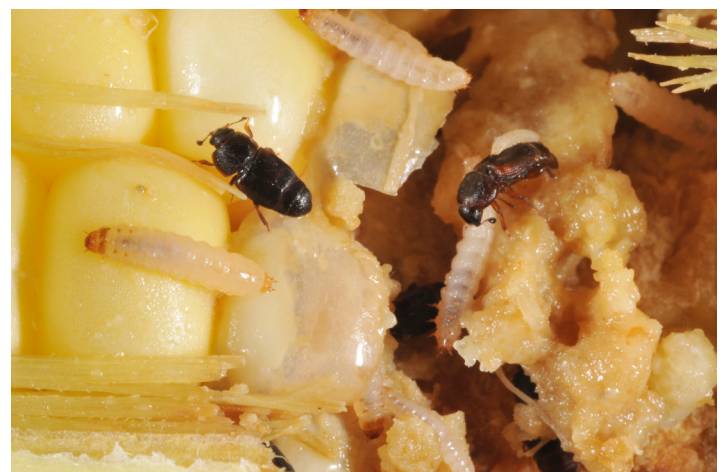
Sap beetles and larva on corn.