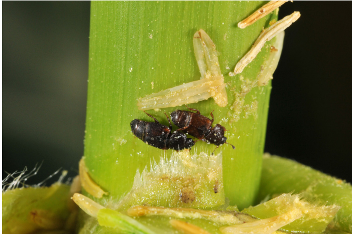
Sap dusky beetles on corn leaf axil.

Larval stages are very active and will try to hide if disturbed. Adults are active during the day and night and although resistant to flight, can migrate up to 2 miles in 4 days. Adult sap beetles are drawn to volatiles from fermenting fruit and grains, thus sanitation is important in controlling these pests. Female dried fruit beetles can lay over 2,134 eggs at 28.1°C (83°F), however the average is 1,071 eggs in her lifetime. The pre-oviposition, oviposition, and post-oviposition periods are 3, 61, and 9 days respectively.