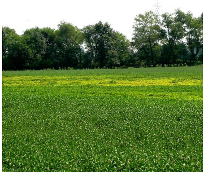
Figure 2. Above ground symptoms of SCN damage to soybean.