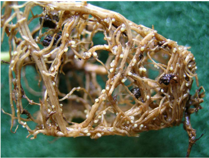
Figure 3. White SCN females on soybean roots.