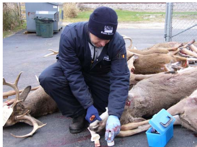
CWD surveillance in Indiana's hunter-harvested deer.

This past fall (2008) the Indiana Div. of Fish and Wildlife collected 862 samples from mostly hunter killed deer to test for Chronic Wasting Disease (CWD). No CWD was detected. Since 2002 over 10,000 samples have been tested without a single positive.