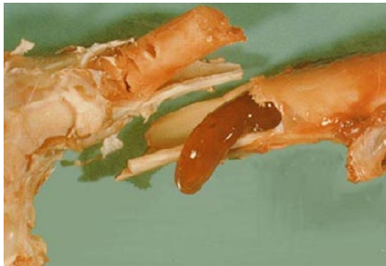
Bone marrow fat analysis can aid in diagnosing starvation.

the result. Wild ruminant physiology has developed to allow them to withstand dietary deficiencies and obtain energy from the consumption of poor quality forage. Adult ruminants are able to store large amounts of nutrients and fat within their body tissues. They are also