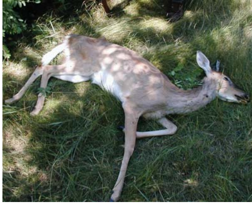
Malnourished deer due to CWD.

from insufficient nutrition. Currently we have 3 primary species that die from malnutrition or starvation: white-tailed deer, mute swan, and wild turkey. The majority of the animals have come from the Upper Peninsula and the northern half of the Lower Peninsula with mortality occurring almost exclusively during the winter when food availability is at its lowest.