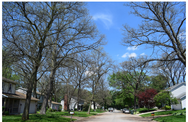
Spongy moth caterpillars can completely defoliate oaks and other deciduous trees in early summer.

Where spongy moth has already been established in Indiana, environmentally safe tools that foster and conserve the natural enemies of spongy moth will be used to maintain the appearance of urban forests and the health of woodland ecosystems. Where it's not yet established, the Indiana Department of Natural Resources will continue the trapping program it began in 1973 to detect man-made introductions.