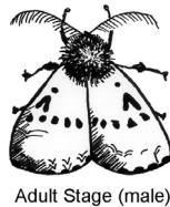
Adult Stage (male)

Pupae —By early June, caterpillars stop feeding and change into pupae, their transition stage from caterpillars to adult moths. Pupae are dark brown shell-like cases that are about 2 inches long and sparsely covered with hairs. They do not spin webs or make a cocoon.