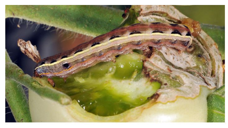
Yellow striped armyworm larva

The caterpillars can be pale gray to black. There is usually a yellow or cream colored strip running along the length of its body. On the first abdominal segment, there is a large dark spot (see arrow) on either side of its body. Eggs are laid in groups of 20-30 near fruit. Small larvae feed on leaves for a short time and then attack fruit. Feeding damage to fruit consists of 1/8-1/4 inch wide holes, over the entire fruit and fruit cluster. One or two larvae can destroy two to three clusters of tomato fruit.