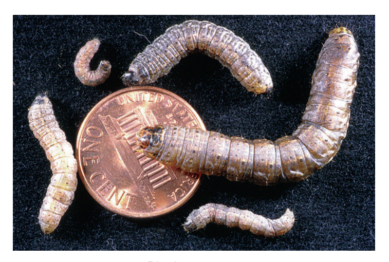
Black cutworms

Both cutworm larvae feed at night and can cut small plants at or 1-2 inches above the soil surface. Once plants are 1-foottall, treatment should be unnecessary. Fields should be scouted in the early morning (up to 2 hours after dawn) for the presence of larvae or their damage. One larva per 100 plants and the presence of cut plants indicate that control is necessary. Fields that have many winter annual weeds, such as chickweed or henbit, should be worked (or weeds destroyed) at least 10-14 days before any tomato plants go into the field. Cutworm moths lay eggs on these weeds and cutworms will begin feeding there. If fields are not worked early enough, cutworms will survive and feed on tomatoes. Variegated cutworms can also feed on the foliage or small fruit of mature plants, because of this they are also called "climbing cutworms."