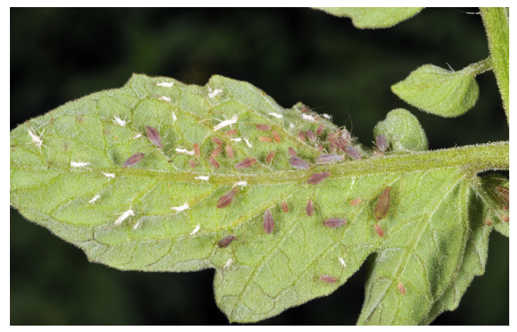
Aphids and cast skins on tomato leaf

Aphids can be pests throughout the growing season. Fields should be scouted weekly and the underside of leaves checked for aphids. Fortunately, aphids are controlled by a number of natural enemies. Therefore, insecticide sprays should be kept to a minimum to prevent the destruction of the aphids' natural enemies.