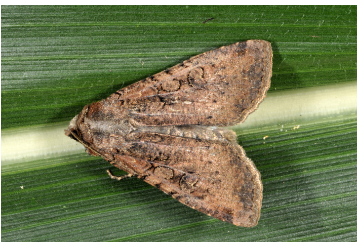
Variegated cutworm, (top) (bottom) adult