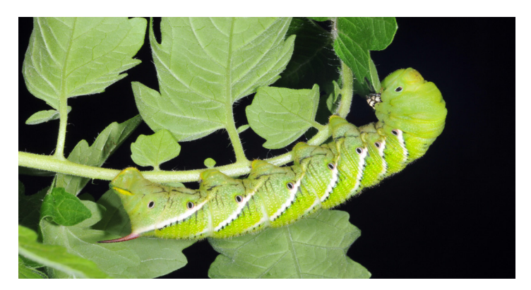
Hornworm larva

When hornworms are large, 2-4 inches, insecticides may not control them. They are best controlled when still small, 1/2 - 13/4 inches. So, scout fields for hornworms starting in late June. Watch for hornworms, plants with feeding damage, or the presence of frass (feces). However, when feeding is found, hornworms are small (less than 2 inches), and 2-4% of plants throughout a field show severe feeding, then a treatment is necessary.