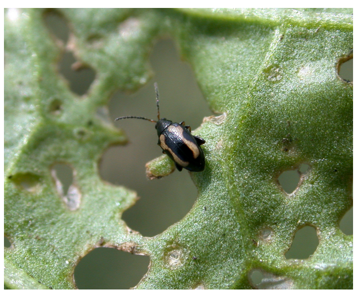
Palestriped flea beetle and damage

Flea beetles are very small (1/16 - 1/5 inch long), usually dark-colored beetles that, when disturbed, can quickly hop away. Flea beetles feed on the leaves and create small, round holes. Flea beetles are not a problem unless their populations become very high and/or feeding damage is severe. Fortunately, several insecticides can control these pests fairly easily.