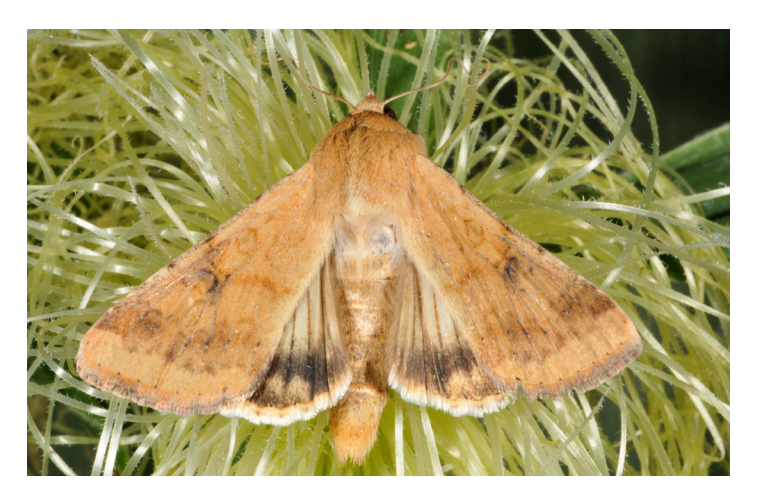
Corn earworm adult

When eggs hatch, caterpillars quickly begin to bore deeply into the fruit, contaminating the area with feces. Caterpillars prefer to feed on green fruit and will seldom enter ripe fruit.