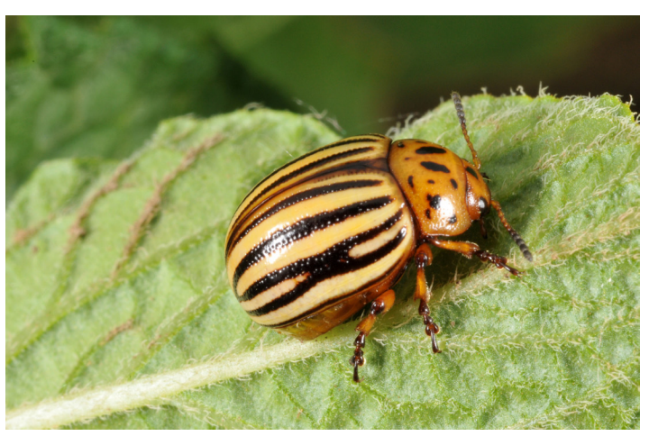
Colorato potato beetle, (top) larva; (bottom) adult