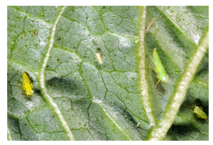
Potato leafhoppers adult (I) and nymphs (r)

Leafhoppers are easily controlled with insecticide applications. They only need be treated when large populations are observed when fields are scouted, or at the first sign of hopperburn.