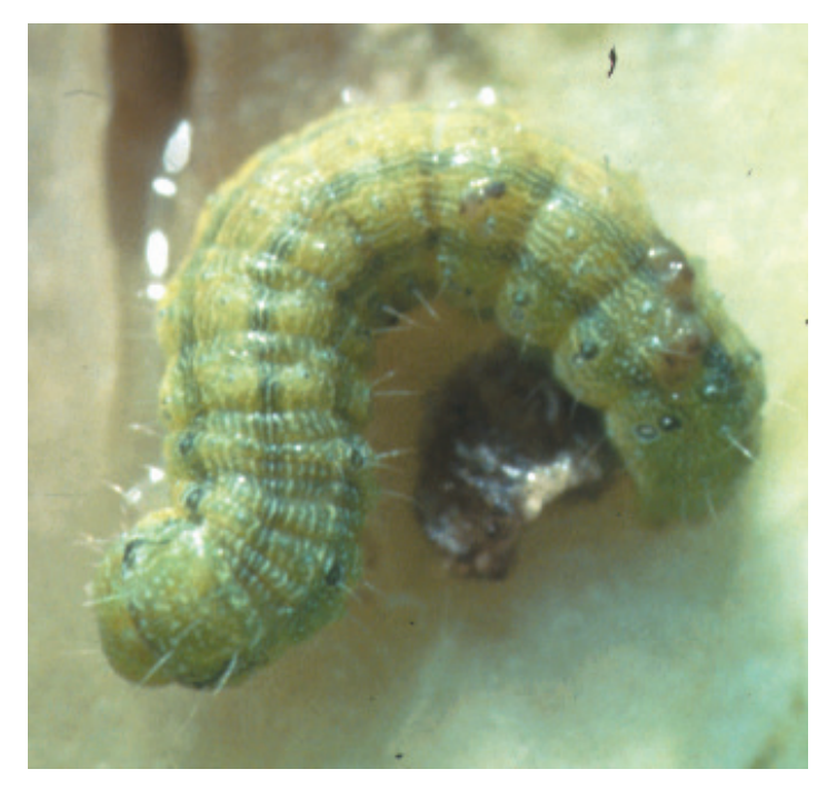
Tomato fruitworm larva

Female moths prefer to lay their eggs on corn, especially sweet corn. They also lay eggs on tomato plants (usually near flowers), on terminal leaflets, or underneath the calyx of green fruit.