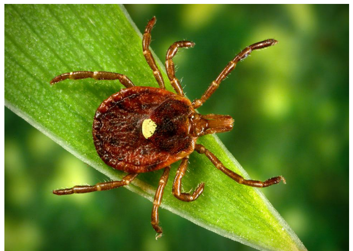
Lone star tick