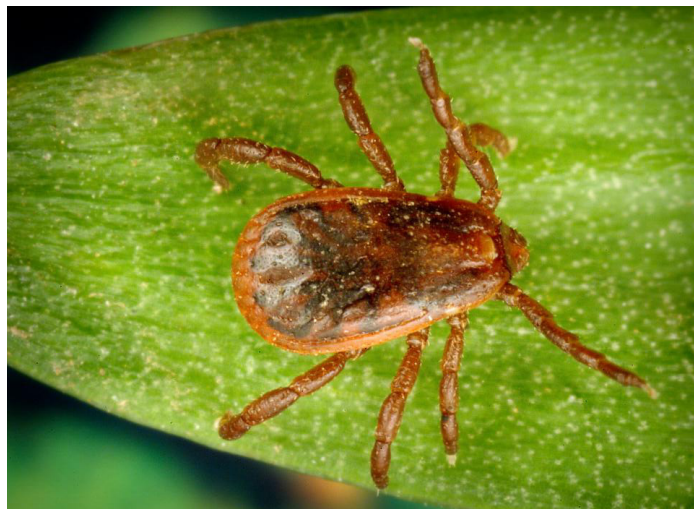
Brown dog tick

around pet bedding areas. After feeding, these ticks drop off their host and conceal themselves in any available cracks and crevices. Because of their strong tendency to climb, they are often found behind cove moldings and window frames and in furniture.