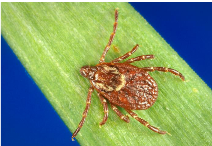
American dog tick

This tick is also commonly found in moist, wooded areas, especially in areas with established deer populations. Adults have long mouth parts. The adult female has a distinct single white spot on its back. This tick is extremely aggressive and nonspecific in its feeding habits, with all active life stages (larvae, nymphs, adults) feeding on a wide variety of mammals (including humans) and ground-feeding birds. Adults and nymphs are generally active from early spring through midsummer, with larvae (often called "seed ticks") being ac-