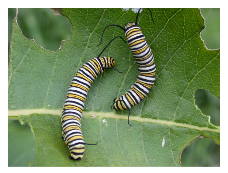
Figure 7. Non-target plants (such as milkweed) can absorb neonicotinoid residues and affect non-target insects (such as monarch butterfly caterpillars).

The same study demonstrated that in slug-infested fields, soybean grown without neonicotinoid seed treatments produced higher plant populations and yields than their treated counterparts. This study has important management implications, since slugs are emerging as a key pest in no-till cropping systems in many parts of the northern soybean production region.