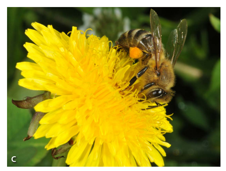
Figure 6. (A) Planter dust generated when planting treated seed contains a very high concentration of neonicotinoids that (B) can move off-target, and (C) potentially harm beneficial organisms.