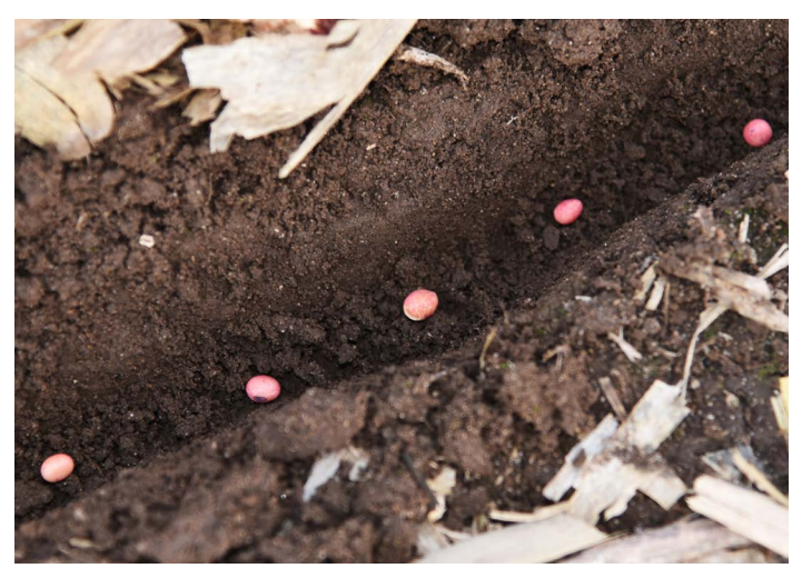
Figure 1. Neonicotinoid-treated soybean seed before soil covering.