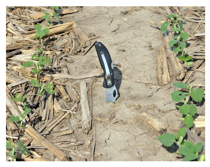
Figure 3. Early-season bean leaf beetle feeding on untreated soybean seedlings (left) and on neonicotinoid seed-treated seedlings (right). This minor feeding does not reduce yield.

The U.S. EPA extensively reviewed published and unpublished data regarding the yield benefits and concluded that "neonicotinoid seed treatments likely provide $0 in benefits to growers" (USEPA 2014).