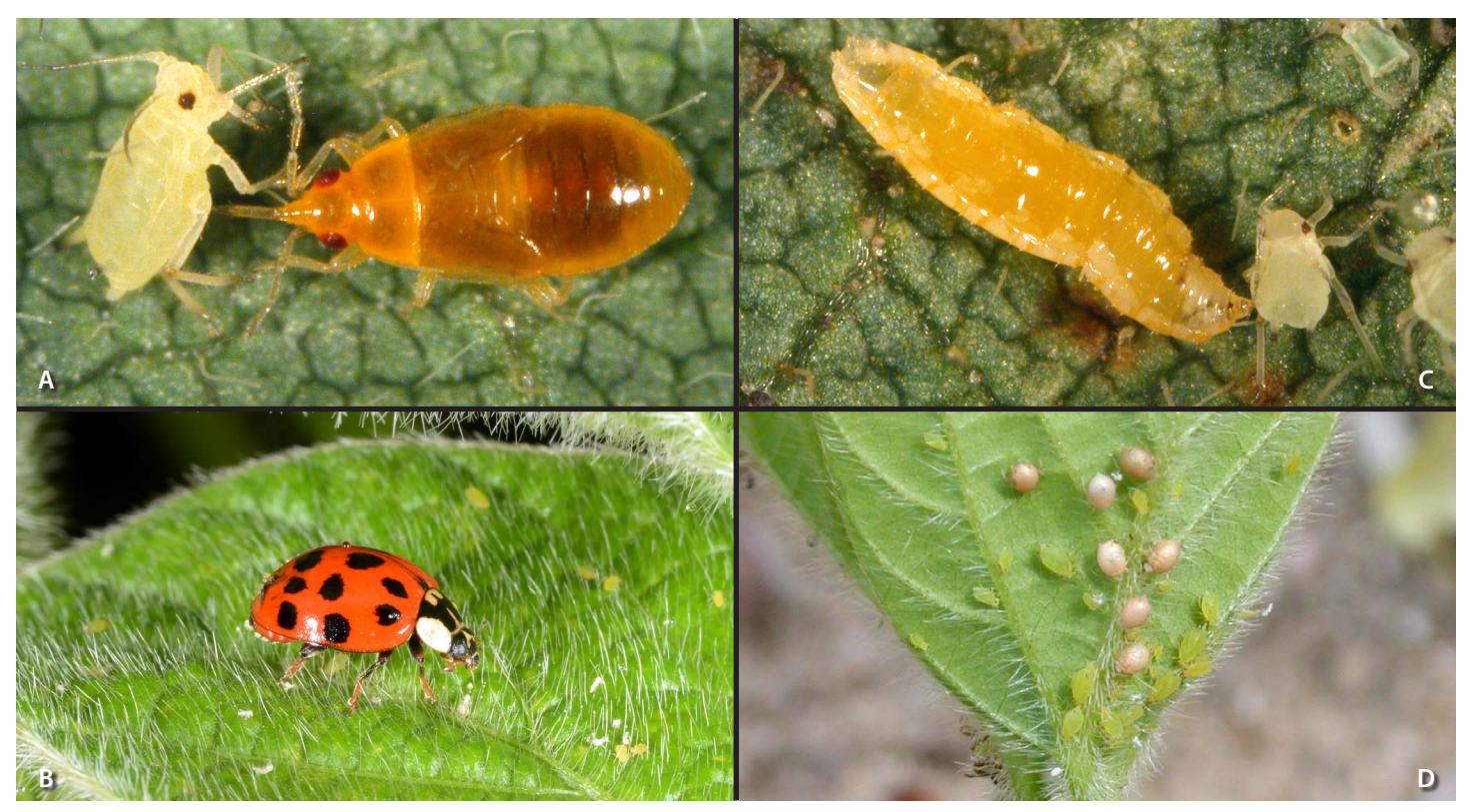
Figure 5. Predators, such as (A) an Orius nymph, (B) Asian lady beetle, (C) aphid midge larva, and (D) parasitic wasps typically suppress early-season infestations of soybean aphid.

Figure 4. The relative concentration of the neonicotinoid thiamethoxam (the active insecticidal ingredient in CruiserMaxx<sup>®</sup> seed treatment) decreases rapidly after planting (represented by the red triangle). There is little or no insecticide remaining in soybean plants by the time soybean aphid populations typically begin to increase (represented by the purple-blue curve).