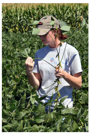
Figure 9. Scouting for insect pests is the tried and true approach.

Most insect pests of soybean have wellestablished scouting guidelines and thresholds (Figure 9). Specific recommendations are available from university extension service websites and publications (consult your state extension service). When pest problems occur, the best management is based on an integrated approach that can include rotating crops, conserving