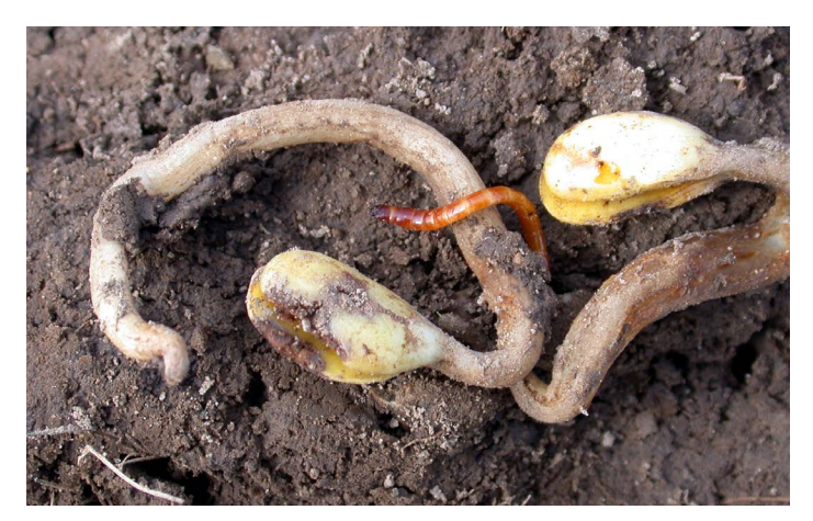
Figure 2. Wireworm feeding seldom reaches economically damaging levels.

These high-risk scenarios are uncommon in northern states. Seed and seedling pests such as wireworms, white grubs, and seedcorn maggots rarely reach economically damaging levels in the vast majority of soybean fields (Figure 2). Adult bean leaf beetles are