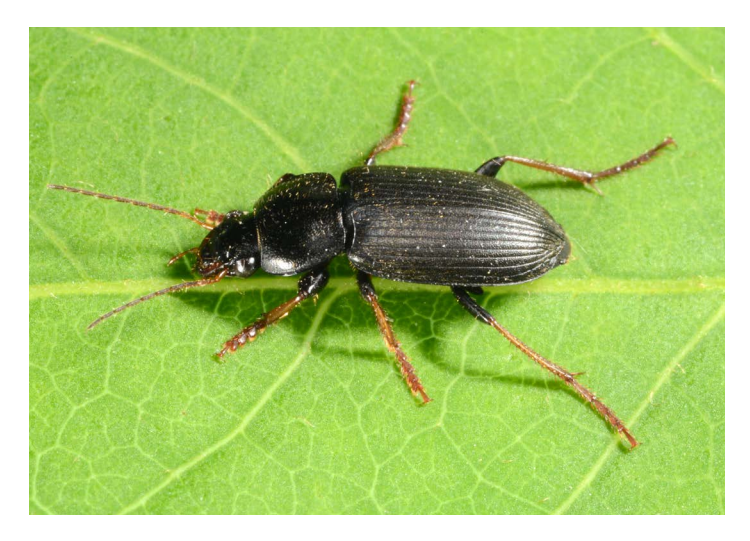
Figure 8. Ground beetles typically control slug populations. But slugs that feed on plants grown from neonicotinoid-treated seeds can pass the insecticide to the beetles.