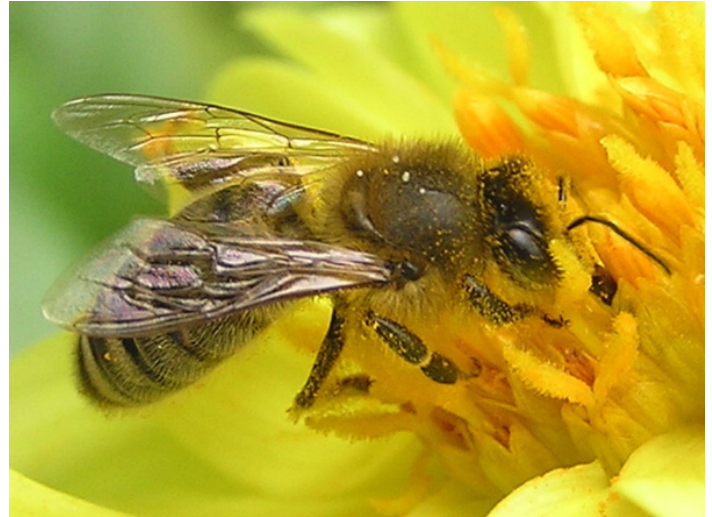
Figure 2. A worker honey bee, Apis mellifera .

abandoned rodent nests, and people rarely come in contact with them. Colonies of many species of bumble bees contain fewer than a hundred workers, and the workers are much less prone to sting than are honey bee workers. Little has been reported on the chemistry of bumble bee venoms, but they share at least some allergens with honey bee venom and have been associated with allergic reactions.