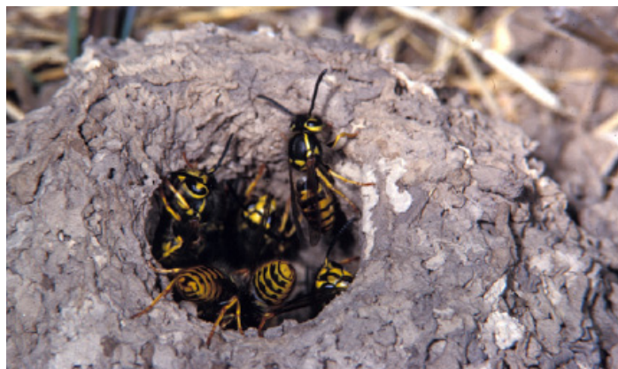
Figure 3. A view into the entrance tunnel of a ground nest of a yellowjacket.

The social wasps that are of greatest medical risk (equal to honey bees and for many of the same reasons) throughout the U.S. are the yellowjackets and to a lesser extent the hornets . Both groups exist in colonies containing hundreds to several thousand workers associated with a nest made of papery material. Yellowjacket and hornet larvae are reared in cells formed into multiple combs that are fully enclosed within a thick papery envelope. Paper wasps , or umbrella wasps, are significant medical risks primarily in the southern and southwestern U.S. However, the relatively recent establishment of a European species, Polistes dominulus , over much of the northern U.S. may change this situation because this species is increasingly common in urban areas and workers are more prone than native species to sting in defense if their colony is disturbed. The common names “paper wasp” and “umbrella wasp” are descriptive because the papery