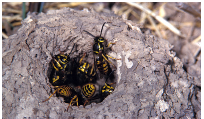
Figure 3. A view into the entrance tunnel of a ground nest of a yellowjacket.

The social wasps that are of greatest medical risk (equal to honey bees and for many of the same reasons) throughout the U.S. are the yellowjackets and to a lesser extent the hornets . Both groups exist in colonies containing hundreds to several thousand workers associated with a nest made of papery material. Yellowjacket and hornet larvae are reared in cells formed into multiple combs that are fully enclosed within a thick papery envelope. Paper wasps , or umbrella wasps, are significant medical risks primarily in the southern and southwestern U.S. However, the relatively recent establishment of a European species, Polistes dominulus , over much of the northern U.S. may change this situation because this