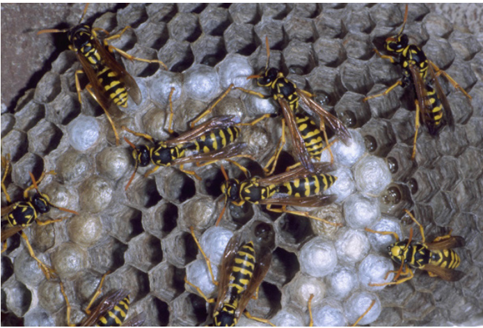
Figure 4. Females of the European paper wasp, Polistes dominulus , on their nest.

species is increasingly common in urban areas and workers are more prone than native species to sting in defense if their colony is disturbed. The common names “paper wasp” and “umbrella wasp” are descriptive because the papery nest consists of a single comb that is not enclosed within an envelope and nests usually resemble an umbrella in shape when they are suspended from eaves of a building. Their colonies are much smaller than those of yellowjackets and hornets, usually containing fewer than a hundred workers.