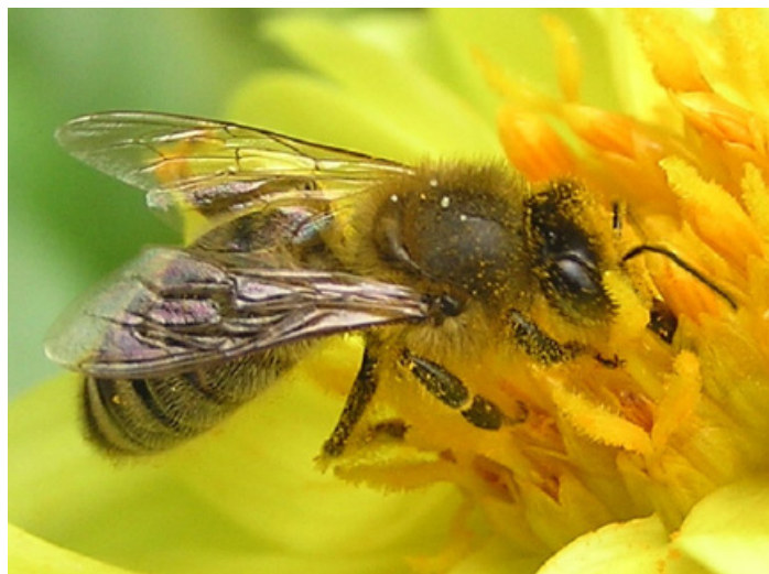
Figure 2. A worker honey bee, Apis mellifera .

with them. Colonies of many species of bumble bees contain fewer than a hundred workers, and the workers are much less prone to sting than are honey bee workers. Little has been reported on the chemistry of bumble bee venoms, but they share at least some allergens with honey bee venom and have been associated with allergic reactions.