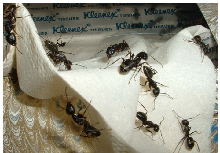
Carpenter ants

All insecticides are potentially hazardous. Therefore, do not apply on or near food or on surfaces where food comes into direct contact. Wipe-up any excess spray. Be sure to read, understand, and follow all label directions.