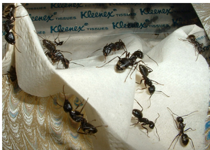
Carpenter ants

All insecticides are potentially hazardous. Therefore, do not apply on or near food or on surfaces where food comes into direct contact. Wipe-up any excess spray. Be sure to read, understand, and follow all label directions.