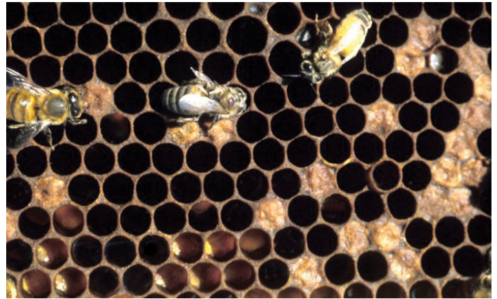
Figure 3. This photo shows symptoms of parasitic mite syndrome. Note the two worker bees with deformed wings and a mite on the bee in the center. The brood pattern is spotty because bees have removed dead larvae.

Typical symptoms include evidence of a number of virus and brood diseases, but sometimes the colony just dwindles