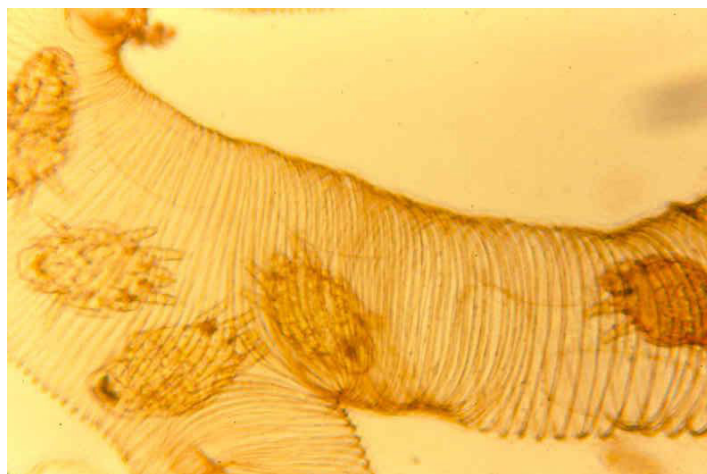
Figure 1. Tracheal mites inside of the thoracic tracheae of a honey bee (400X magnification).

Unlike Varroa mites which are ectoparasites, tracheal mites are microscopic parasites that live inside the tracheae in the bodies of bees (Figure 1). The tracheae are the breathing tubes of insects that distribute oxygen throughout the tissues in their bodies. Female mites emerge from the thoracic trachea and infest bees that are generally less than 24 hours old. Older bees are resistant to infestation. Tracheal mites partly block the breathing passages. Their presence