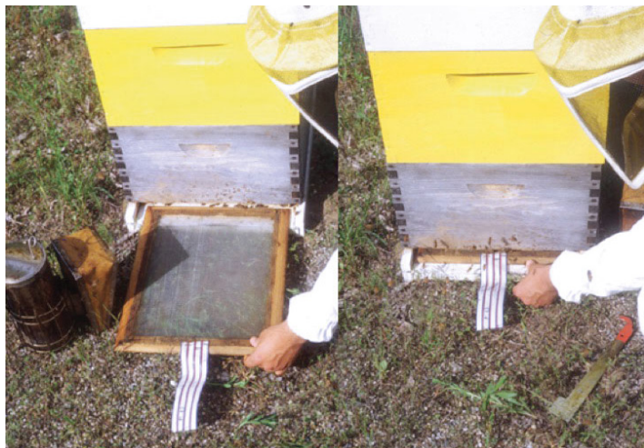
Figure 4. This beekeeper is inserting a homemade sticky board sampling device into a hive to monitor varroa mite populations.

The most sensitive method for detecting mites is to sample them with a “sticky board.” Some hive boxes have screened bottom boards and a plastic sheet can be inserted after spraying it with vegetable oil. Or, you can construct a sticky board of three-eighths-inch-thick wooden frame with a screen stapled to it. Put contact paper on the bottom, spray vegetable oil on it, and insert it in the colony entrance (Figure 4). The screen prevents the bees from removing mites from the sheet.