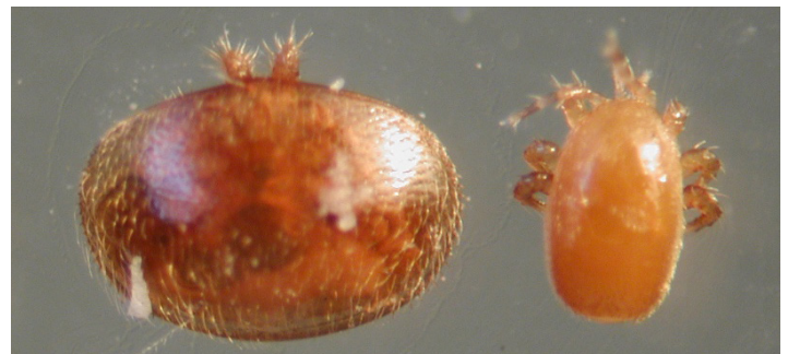
Figure 5. A Varroa mite on the left and a Tropilaelaps mite on the right.

Tropilaelaps feed and reproduce only on bee larvae in brood cells. They damage bees in a way that is similar to Varroa because they transmit viruses during feeding, such as deformed wing virus. Tropilaelaps are much smaller and can move much faster than Varroa (Figure 5). Their mouth parts are not large enough to allow them to feed on adult bees and these mites usually die within 3 days when no brood is present to feed on or to lay eggs upon. A break in the brood cycle occurs in temperate climates as the queen honey bee stops egg laying as winter approaches. Putting bees in a screen package without brood for 48 hours has been considered sufficient to rid the bees of Tropilaelaps . For these reasons Tropilaelaps is unlikely to become a major problem in the U.S., at least outside of Florida, where honey bees can have brood year-round. But Tropilaelaps mites have been found in South Korea and northern China, which have temperate climates. At this time, there is no reason for beekeepers in the Midwest to be concerned about this pest.