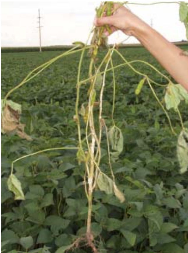
Fig. 1. Soybean plant with white mold infection. Leaves are heavily wilted.

Yield reduction depends on when white mold first affects a soybean plant. A girdling stem lesion largely prevents movement of water and nutrients from the root system to the foliage. If the soybean has not