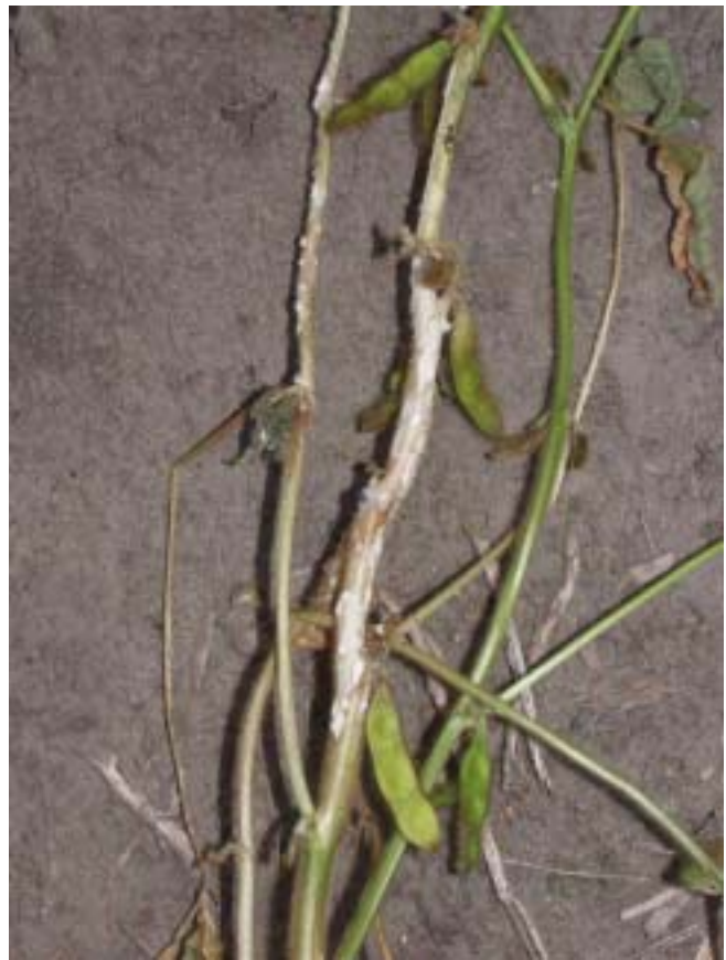
Fig. 2. Stem lesion, typical white covering on soybean plant.