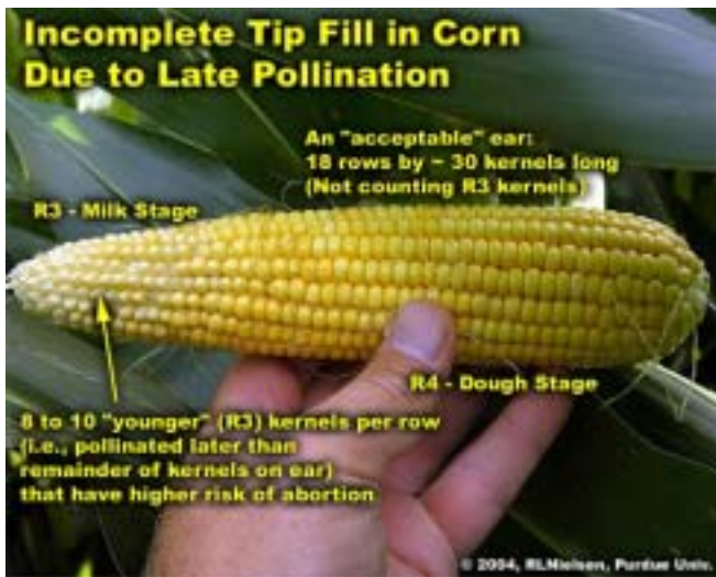
Unusually lengthy ear whose younger tip kernels are showing signs of abortion.