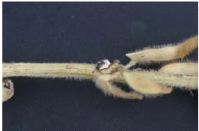
Fig. 3. Sclerotium on the outside of soybean stem.

matured by the time a girdling stem lesion develops, seeds may remain small and be lost during harvest. Seed of plants affected later may be of more normal size. Yield loss is related to time of infection and how much of a field is affected.