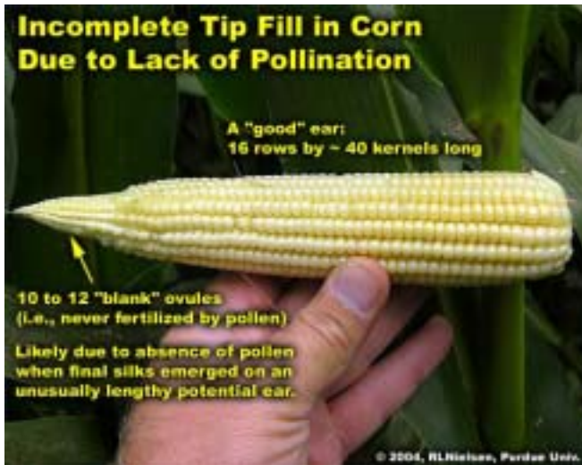
Unusually lengthy ear exhibiting incomplete tip fill due to lack of pollination.