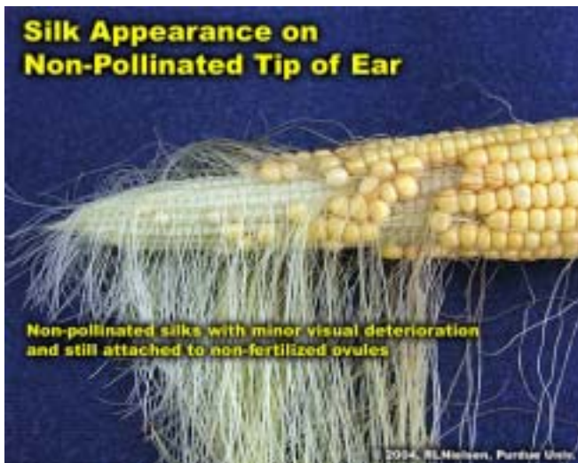
"Fresh" silks associated with non-pollinated barren ear tips.