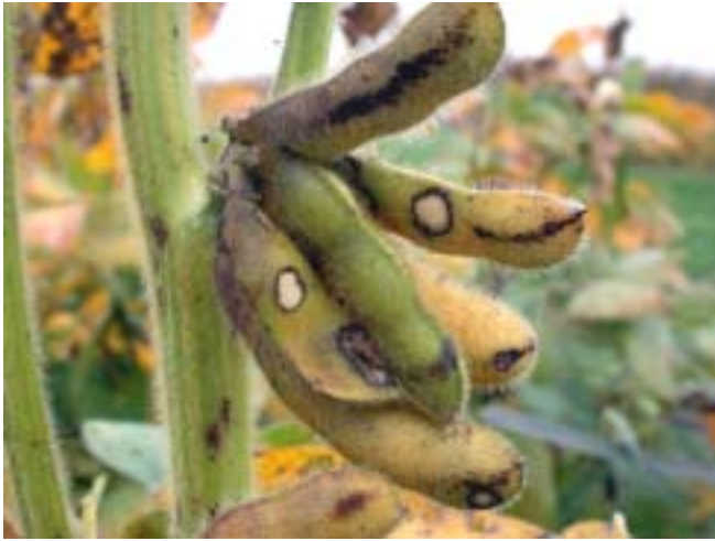
Bean leaf beetle pod scarring

pod development (i.e., green, yellow, yellow-brown, or brown pods). Once the pods turn yellow to yellow-brown, they become less attractive and less susceptible to damage. Control is normally not warranted from this point on (see the following table).