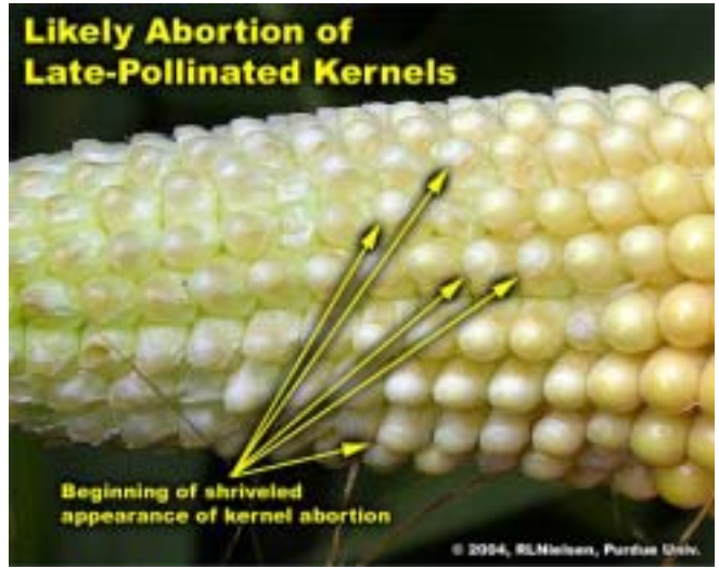
Closer view of tip kernels showing signs of abortion.