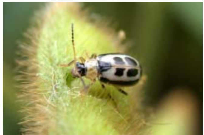
Bean leaf beetle feeding on pod

While sweeping soybean fields for western corn rootworm beetles over the past several weeks, we saw varying numbers of bean leaf beetles. Overall the bean leaf beetle numbers are low and of little concern to commercial production fields. Soybeans grown for seed should be monitored as leaves begin to yellow and pods remain green. Bean leaf beetles scar the surface of pods, but only occasionally feed through the pod to the developing beans. During pod maturation, this scar often cracks leaving an entry hole for air borne plant pathogens that may cause discolored, moldy, shriveled, and / or diseased beans.