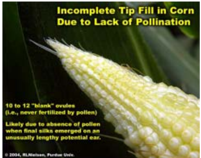
Closer view of non-pollinated tip of lengthy ear.