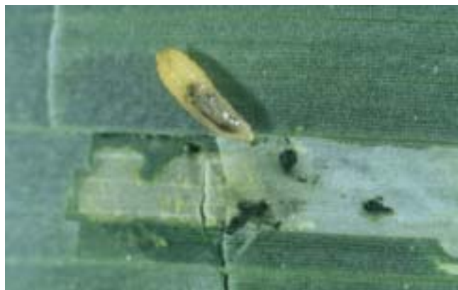
Corn blotch leafminer larva and damage

their host, the blotch miner would undoubtedly prove a pest very difficult of control. This species seems to furnish an instance in which only the barrier of parasites stands between the farmer and what may easily become temporarily at least, a very serious pest." Speculation as to why there is an "outbreak" of corn blotch leafminer points to either unique environmental conditions, which includes many variables, or practices that are inhibiting the natural parasites (e.g., multiple broadcast pesticide applications).