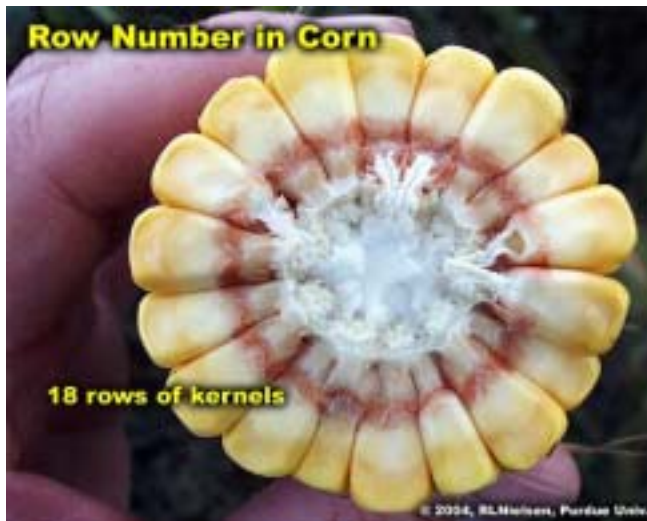
Example of 18-row ear.

TIP: Use a lower value (e.g., 80) if grain fill conditions have been excellent (larger kernels, fewer per bushel) or a larger value (e.g., 100) if grain fill conditions have been stressful (smaller kernels, more per bushel).