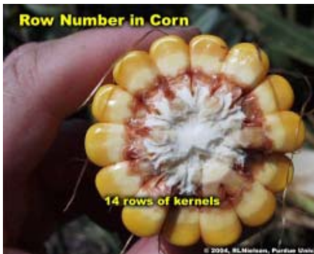
Example of 14-row ear.