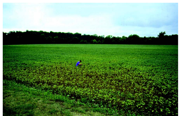
Spider mites moving in from field edge.

with any of these other plant stressers. Spider mites may or may not be causing the problem. In other words, it's the old chicken and egg dilemma. Stressed plants actually provide a better nutritional feast for spider mites thus they thrive and quickly colonize areas or whole fields. The best spider mite control is to eliminate plant stress, and this is sometimes easier said than done.