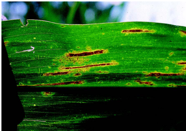
Early gray leaf spot lesions

Common rust, caused by Puccinia sorghi , was widespread in Indiana last year, and some hybrids had more of this disease than is typically seen. Last year, rust was well established by mid June. The rust I saw in the seed corn field was still very light – only a pustule or two on some plants. As with gray leaf spot, growers should be on the lookout for rust. It is more likely to be a problem in seed corn fields, specialty hybrids, and sweet corn, than in yellow dent hybrid corn.