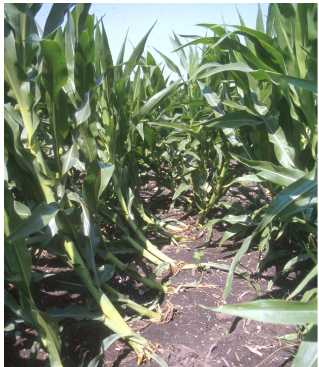
Lodged corn plants

Corn plants that have tilted or lodged should be dug, not pulled, and then inspected for root feeding scars. Pay particular attention to the nodes of roots just below and above the soil surface. These may have been completely destroyed. There is nothing that can be done to correct this year's damage. However, these fields may have a tremendous beetle population as the adults continue to emerge from the soil. Those who have significant damage and who used full rates of rootworm insecticides should be contacting their dealer or manufacturer's representative to have them evaluate product performance. Remember, products are generally guaranteed to work at recommended rates.