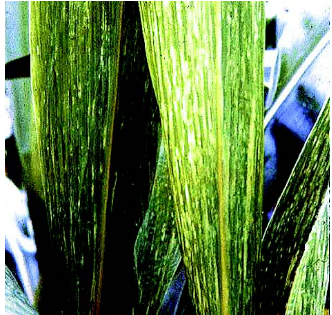
Corn infected with MDMV.

Use hybrids selected for tolerance to the corn virus complex for fields with significant risk of the disease. Most seed companies have at least some hybrids with moderate to good tolerance to the disease. In addition, control rhizome johnsongrass to reduce the source of overwintering inoculum.