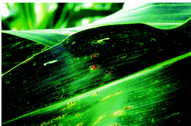
Common rust pustules