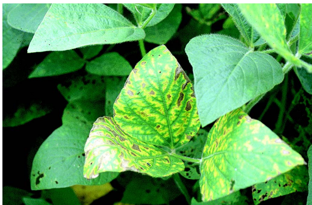
Interveinal necrosis from soybean death syndrome

There are no remedial measures that can be taken at this stage if sudden death syndrome is detected in a field. However, documenting the pattern and severity of the disease in a field will provide useful information for future crop management decisions. Most varieties adapted for production in Indiana are susceptible to sudden death syndrome, but a few have a degree of resistance.