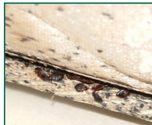
Bed bugs and stains on mattress seam