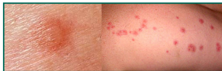
Examples of bed bug bites

Start with the beds or other sleeping areas (this includes couches and sofa beds). You'll be looking for signs of bed bugs (living or dead), their eggs, and staining. Make sure to check all creases, cracks, crevices, and seams since these are the areas that bed bugs like most.