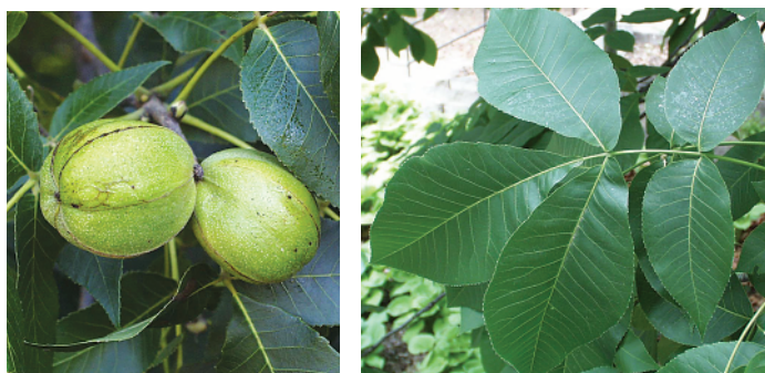
*Paul Wray, Iowa State University

Leaves are compound with 5 to 7 leaflets, but the plant has an alternate branching habit. Fruit are hard-shelled nuts in a green husk.