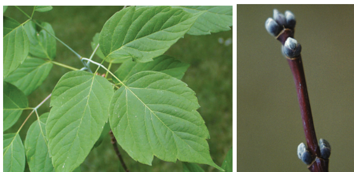
*Paul Wray, Iowa State University

Exhibits opposite branching and compound leaves. However, has 3 to 5 leaflets (instead of 5 to 11) and the samaras are always in pairs instead of single like the ash.