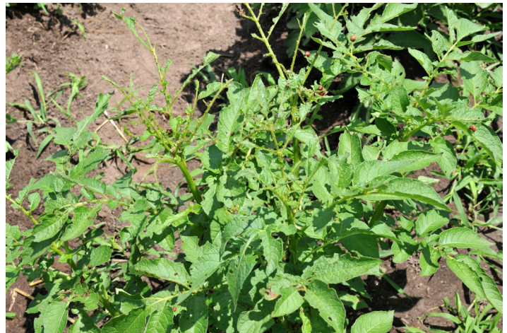
Colorado potato beetle damage

Although both adults and larvae feed on the leaves of potato and related plants (tomato, eggplant), the most damage is caused by the third and fourth instar larvae. These larvae are large (1/2 inch) and can defoliate a plant within 1-2 days. Potatoes can be defoliated by as much as 30% before flowering or during tuber fill and yields are unaffected. However, when