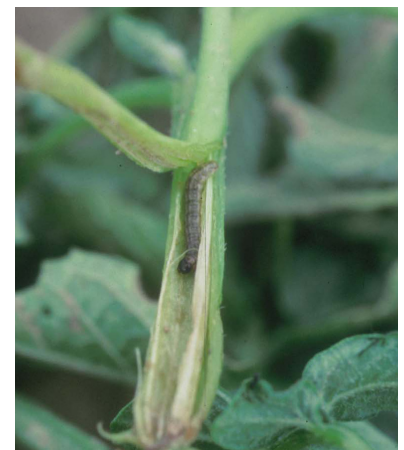
European corn borer larva (l) and damage (r)

READ AND FOLLOW ALL LABEL INSTRUCTIONS. THIS INCLUDES DIRECTIONS FOR USE, PRECAUTIONARY STATEMENTS (HAZARDS TO HUMANS, DOMESTIC ANIMALS, AND ENDANGERED SPECIES), ENVIRONMENTAL HAZARDS, RATES OF APPLICATION, NUMBER OF APPLICATIONS, REENTRY INTERVALS, HARVEST RESTRICTIONS, STORAGE AND DISPOSAL, AND ANY SPECIFIC WARNINGS AND/OR PRECAUTIONS FOR SAFE HANDLING OF THE PESTICIDE.