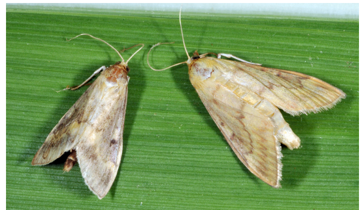
European corn borer adult male (l) and adult female (r)

Larvae bore into the stem soon after hatching and are not controllable once inside the plant. Growers, therefore, have only a short time period to control this pest. Once inside the stem, the larvae plug their entrance hole with frass and begin to tunnel. Often, infested plants will have dead stems. If the base of the stem is inspected, the frass covered entrance hole of the ECB can usually be found. Fortunately, this pest is usually not severe enough in Indiana to warrant control measures.