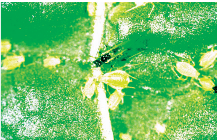
Green peach aphid

There are many natural enemies of aphids, such as lady beetles (adult and larvae), lacewing larvae, syrphid larvae, and parasitic wasps. These predators can be very effective in reducing and controlling aphid populations. These predators, however, are very sensitive to insecticides. Therefore, growers