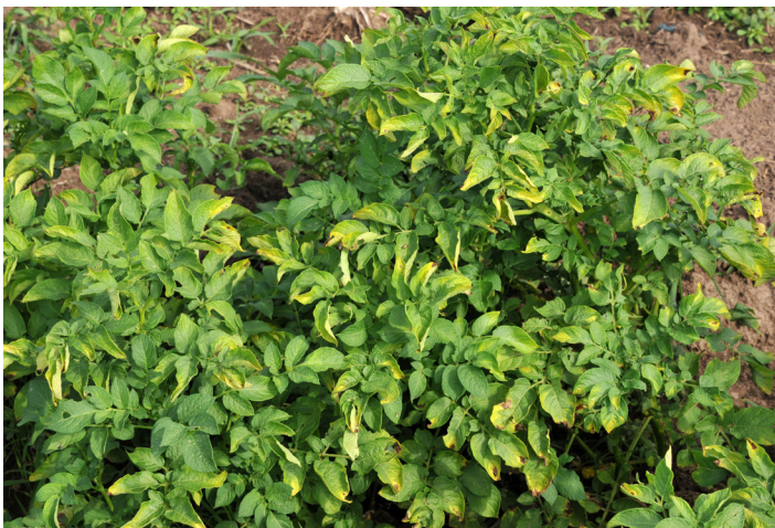
Potato leafhopper damage on potato

blackish-colored, soft-bodied insects usually are found on the underside of leaves. Immatures look like adults, except smaller.