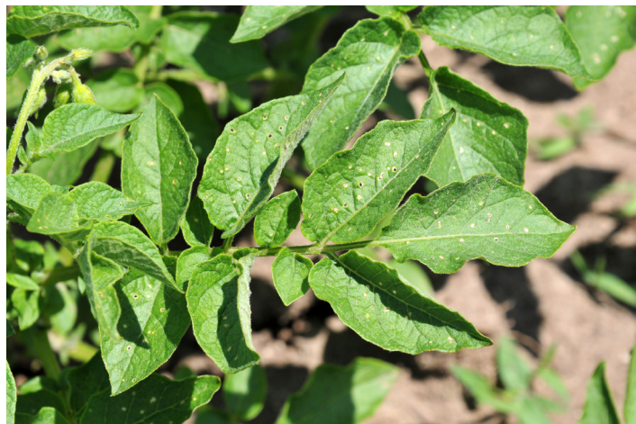
Potato flea beetle damage