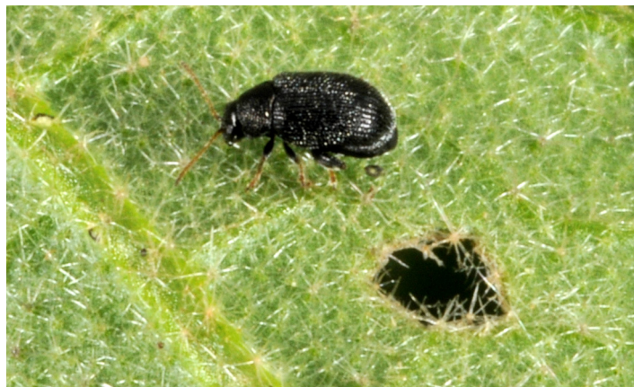
Potato flea beetle and damage

Adult beetles chew small holes in the potato leaves, which creates a shot-hole appearance. Unless beetle populations are very high (2 beetles/sweep with net), damage usually is not economic. If enough defoliation does occur, however, there are numerous insecticides available that will control the population. Most insecticides applied to control CPB or potato leafhopper will also control flea beetles.