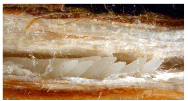
Periodical cicada eggs in stems

Periodical Cicada Emergence in Tippecanoe County 2004