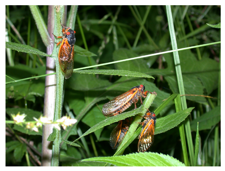
Adult periodical cicadas