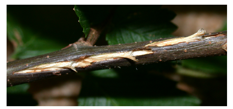
Periodical cicada damage to stems