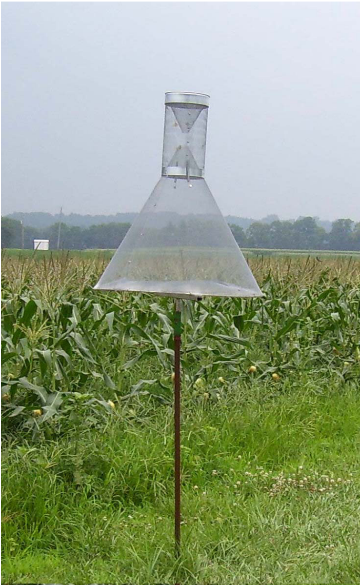
Pheromone trap to monitor corn earworm moths