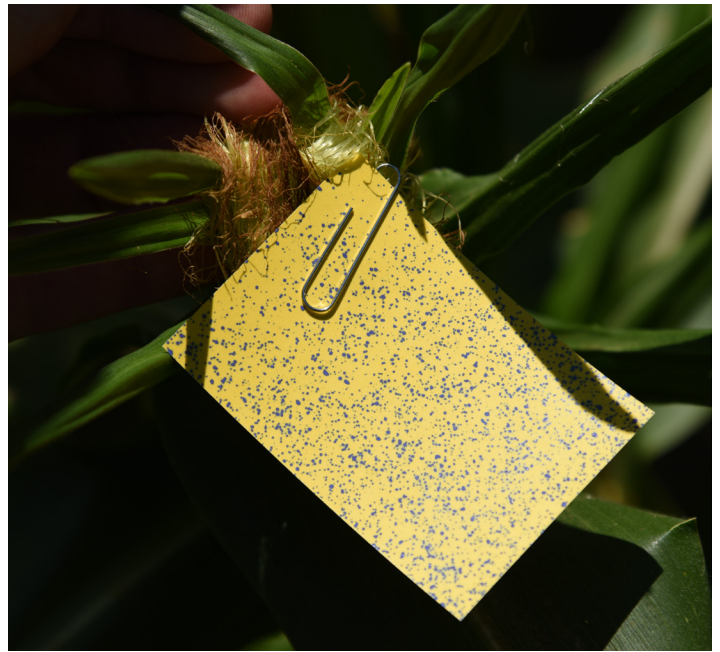
Water sensitive card on tip of sweet corn ear showing good spray coverage after application.

There are varieties of sweet corn available that have had a gene inserted in them that cause the plant to produce the same toxin as the bacterium, Bacillus thuringiensis , or Bt. The sale of Bt sweet corn is somewhat controversial, with some consumers preferring not to eat these varieties, so be sure that your customers will purchase them before you plant them. While this gene will provide some control of corn earworms, many of the varieties that contain a single Bt gene do not provide sufficient control and also require a regular insecticide spray program used with it. Some of the newer Bt varieties have multiple genes for earworm control (as well as