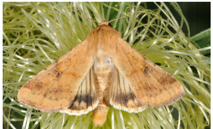
Corn earworm adult