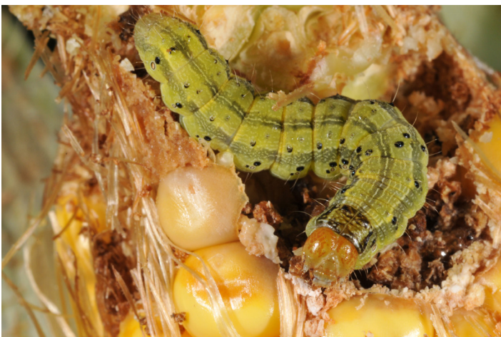
Corn earworm larva

temperature. Shortly after hatching, the young larvae follow the silk channel to the tip of the developing ear, where they feed, consuming kernels and fouling the ear with excrement. Once the larva has entered the ear, there is no effective control. Therefore, chemical control of CEW requires very good protective coverage of the ear zone so that when the eggs hatch, the young larvae will immediately contact a lethal dose of insecticide.