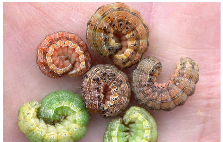
Earworm larvae come in many different colors

The CEW moth, with a wing expanse of about 1-1/2 inches, is buff colored with irregular spots and markings on the wings. The front wings have a dark "comma" shaped spot that is more prominent on the males. The yellowish eggs are small, about half the size of a pin head, and are laid individually. Fresh corn silk is the preferred egg-laying site for the moths. The eggs hatch in 2-5 days, depending on