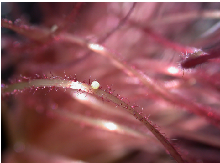
Corn earworm egg on silk