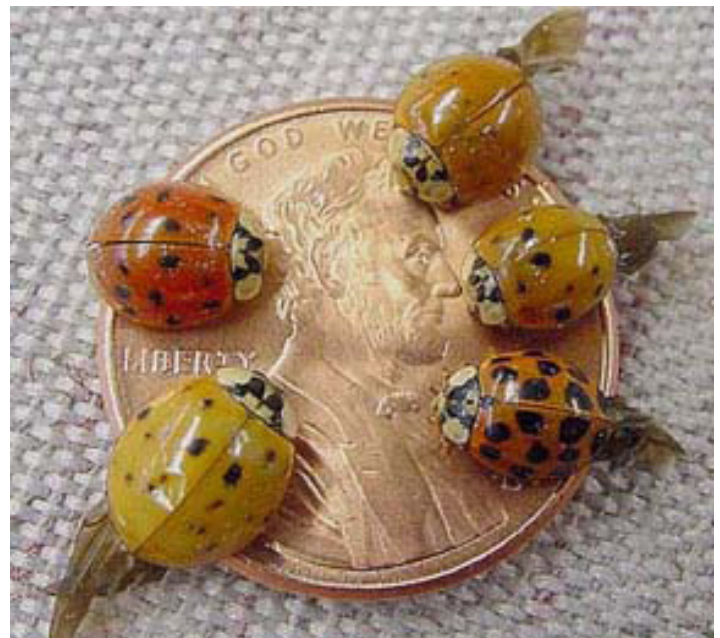
Asian lady beetles with various colors and spot patterns.