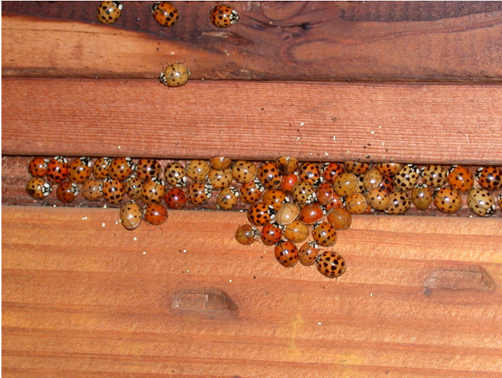
Asian lady beetles congregating.

Congregating begins in mid October and usually reaches its peak by the end of the month. Congregation usually is initiated by the first cold weather snap in October that is followed by warm temperatures. During this congregating activity, hundreds of thousands of beetles may appear around homes, creating a serious nuisance.