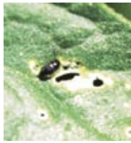
Palestriped Flea Beetle