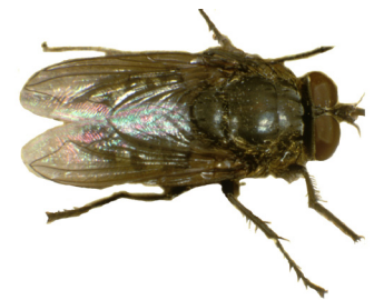
Cluster Fly 3/8"

READ AND FOLLOW ALL LABEL INSTRUCTIONS. THIS INCLUDES DIRECTIONS FOR USE, PRECAUTIONARY STATEMENTS (HAZARDS TO HUMANS, DOMESTIC ANIMALS, AND ENDANGERED SPECIES), ENVIRONMENTAL HAZARDS, RATES OF APPLICATION, NUMBER OF APPLICATIONS, REENTRY INTERVALS, HARVEST RESTRICTIONS, STORAGE AND DISPOSAL, AND ANY SPECIFIC WARNINGS AND/OR PRECAUTIONS FOR SAFE HANDLING OF THE PESTICIDE.