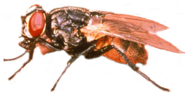
House Fly 1/8" - 1/4"