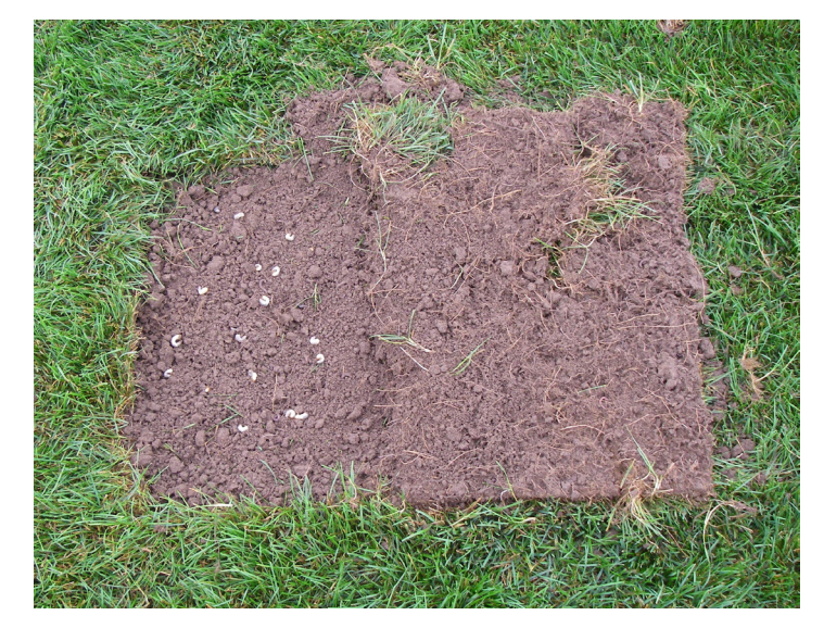
Figure 6. Turfgrass sod peeled back exposing the soil-in-habiting white grubs beneath.

some above-ground insects are only active at night and may be challenging to find during the day. Also remember that the presence of a pest insect is not necessarily cause for concern. Relatively high densities are usually required to cause significant damage.