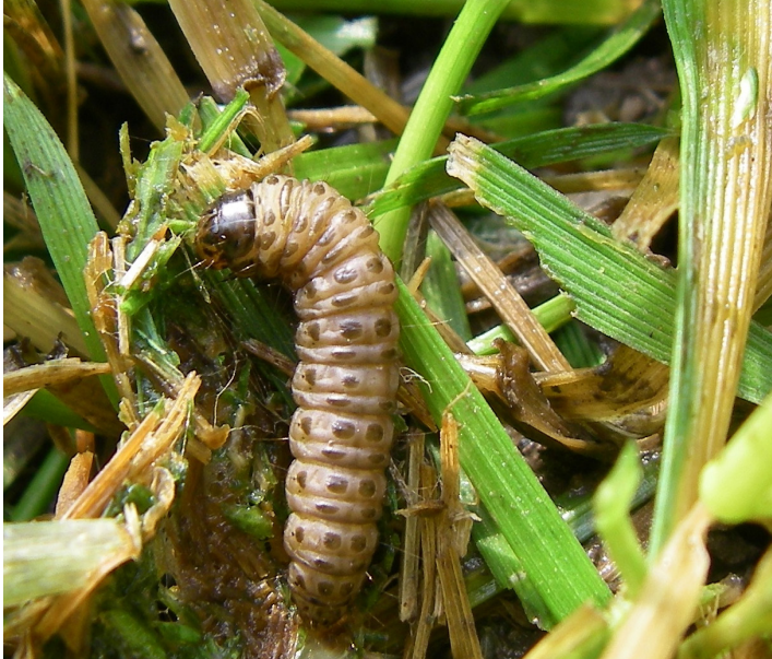
Figure 12. Sod webworm caterpillar with rows of dark, square spots.

Sod webworms are the immature stage (larva/caterpillar) of several small buff-colored moths that are common during the summer months. The moths are easily observed as they fly from the turf when disturbed, only to light again several yards away where they typically align themselves lengthwise along a blade of grass. They roll their wings close around the body when at rest and they posses an elongated snout that gives their heads a conical appearance. Adults do not feed, but mate and drop their eggs into the turf canopy during the evening. Larvae (Fig. 12) overwinter in silken tunnels and emerge in the spring to feed on grass stems crowns and leaves. Damage usually occurs in sunny areas and may appear as irregular, brown patches that take on a thin or ragged appearance during the summer. On short-cut golf course turf, overwintered larvae may attract attention due to their habit of knitting together small pieces of debris or topdressing material over the entrances to their burrows. Two to three generations of sod webworms may occur each season.