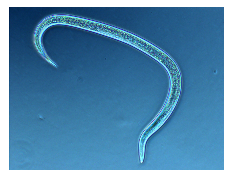
Figure 2. Infective juvenile of the insect parasitic nematode Steinernema carpocapsae , a common biological control agent of above-ground turfgrass insects.

Biologically-based insecticides can provide growers and managers with commercially available, sustainable alternatives for controlling turfgrass insect pests. These products include the insect-parasitic nematodes Heterorhabditis bacteriophora and Steinernema carpocapsae (Fig. 2), the insect-pathogenic bacteria Bacillus thuringiensis kurstaki , Bacillus thuringiensis galleriae , Paenibacillus popilliae , and the bacterial fermentation product, spinosad. When used properly, these products can be very effective and are generally safer than chemical insecticides. However, special considerations are sometimes required when storing or using these products. The amount of time required to reduce pest populations is often longer than with chemical insecticides and biological controls are often more expensive.