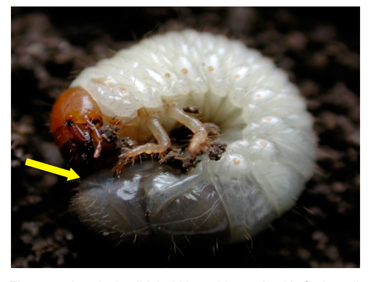
Figure 7. A typical soil-inhabiting white grub with C-shaped body form and clearly visible legs. Yellow arrow indicates location of the raster useful for identifying white grubs to species.