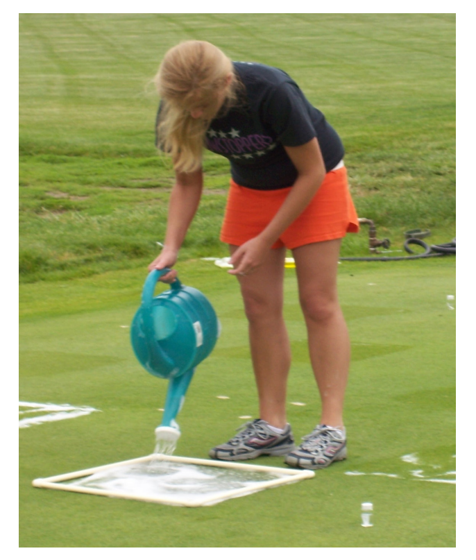
Figure 4. Using a disclosing solution made by mixing 1 tablespoon of liquid dishwashing detergent in 1 gallon of water to flush above-ground insects from the thatch for detection.