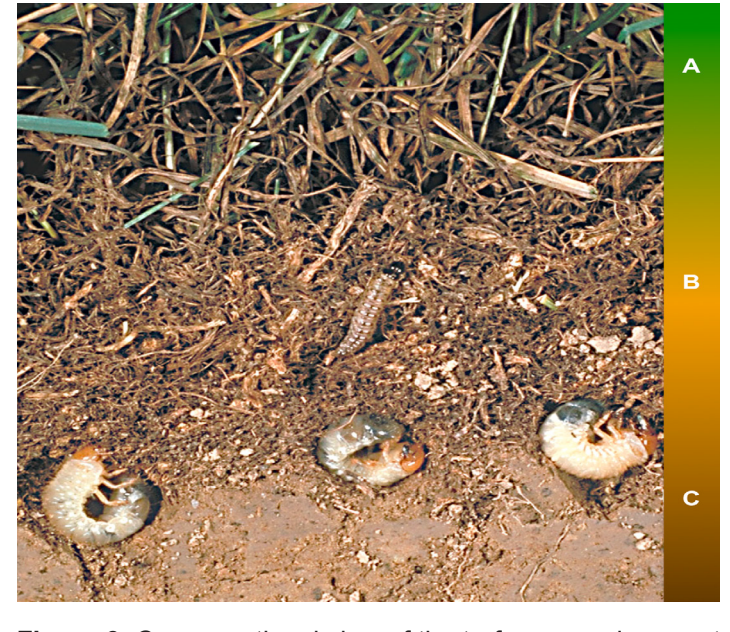
Figure 3. Cross-sectional view of the turfgrass environment and representative insect pests. Note the three distinct target zones; A) stem and leaf, B) thatch, and C) soil. Insects inhabiting zones A and B are considered above-ground insects whereas those inhabiting zone C are below-ground insects.

Knowing the specific portion of the turfgrass habitat occupied by a particular insect pest is essential for proper monitoring, diagnosis and management. Turfgrass insects can be broadly grouped according to where they reside within the turf profile; above- or below-ground . Above-ground pests include caterpillars, billbugs and chinch bugs that feed on the stems, crowns and leaves of plants. Many of these insects are closely associated with the thatch layer that provides cover for