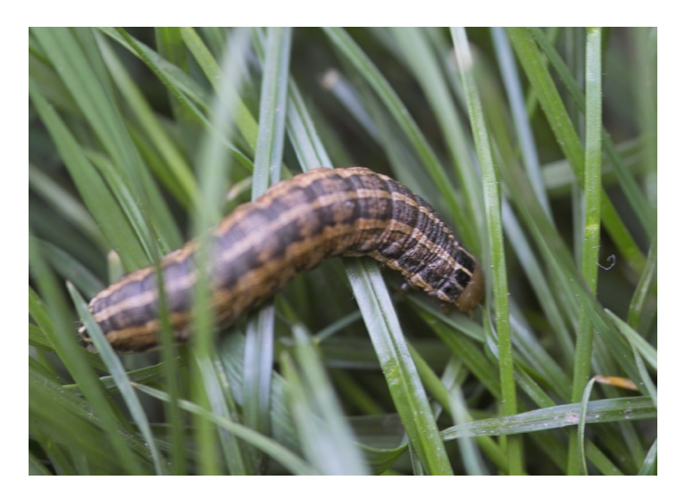
Figure 11. Bronze cutworm caterpillar with alternating dark and light lengthwise stripes.

mowed, golf course turf where it creates unsightly pock-marks or depressions in highly manicured playing surfaces. Black cutworm damage interferes with play and can be a serious nuisance to golfers, especially with regard to their "short game". For more information on the biology and management of black cutworms, see E-270-W Managing Black Cutworms in Turfgrass < https://extension.entm.purdue.edu/publications/E-270/E-270.html>.