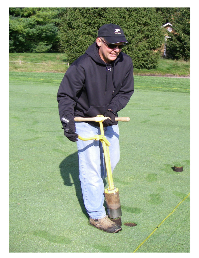
Figure 5. Using a golf course cup-cutter to extract turf and soil cores for detection of below-ground insects.