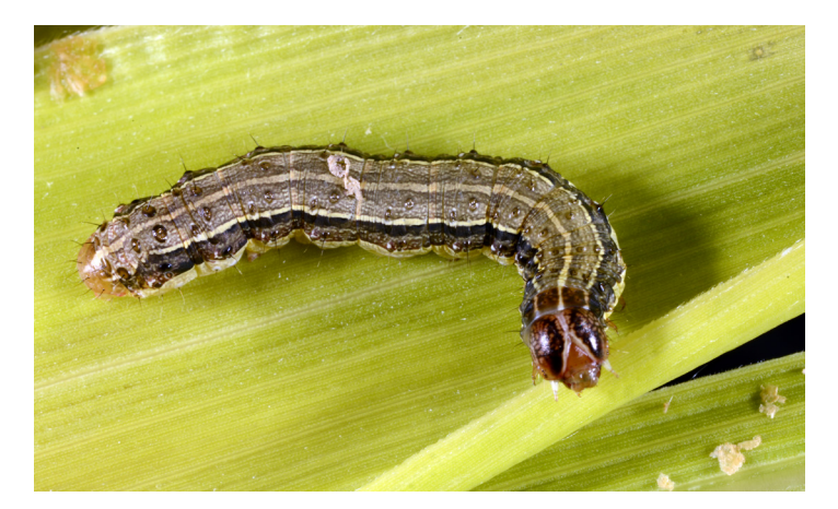
Figure 9 . Fall armyworm caterpillar with lengthwise stripes and inverted Y-shape on head.

patchy and sporadic, but sometimes occur on a larger scale. As their name implies, armyworms may occur en masse and can migrate across large areas of turf, cutting it down to crown level as they go. Because they often go unnoticed while they are small, turf may seem to disappear almost overnight once these insects reach a larger size. Small patches of brown and overall ragged appearing turf are more typical symptoms. Fortunately, unless the turf is severely stressed by drought, it generally recovers well with irrigation or rainfall and adequate fertility.