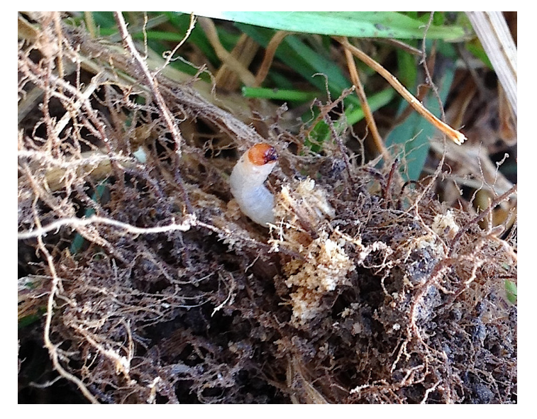
Figure 14. Billbug larva in soil. Note that the larva is legless.

Figure 13. Bluegrass billbug adult with long snout and rows of fine punctures along its back.