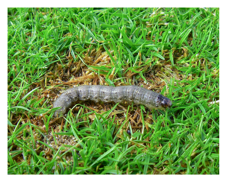
Figure 10. Black cutworm caterpillar and damage on bentgrass.

mowed, golf course turf where it creates unsightly pock-marks or depressions in highly manicured playing surfaces. Black cutworm damage interferes with play and can be a serious nuisance to golfers, especially with regard to their "short game". For more information on the biology and management of black cutworms, see E-270-W Managing Black Cutworms in Turfgrass < https://extension.entm.purdue.edu/publications/E-270/E-270.html>.