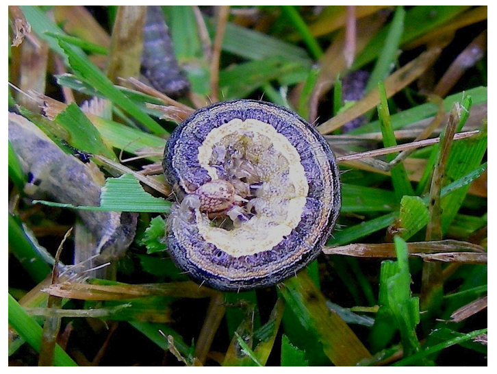
Figure 8. Common armyworm caterpillar with lengthwise brown and/or yellow stripes.

cycle in less than one year (black turfgrass ataenius). Close examination of the pattern of hairs and spines present on the underside of the abdomen (raster) (Fig. 7), using a hand lens or magnifying glass, is usually required to identify white grubs to species. Although the adult forms (beetles) may feed on other plant species, they do not feed on turfgrass.