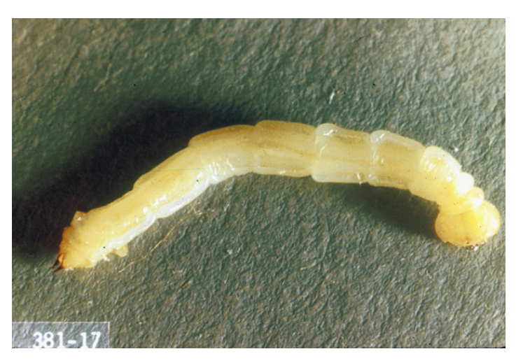
Bronze birch borer larva.

The female deposits her eggs under cracks and crevices of the bark. Eggs hatch in 2 weeks or less, and the slender larvae tunnel immediately into the phloem tissue to construct their galleries. They may occasionally tunnel into the xylem (wood) to molt and overwinter. One or two years may be required to complete larval development. The larvae pupate in the xylem in late April or early May. Adults fly when black locust trees bloom.