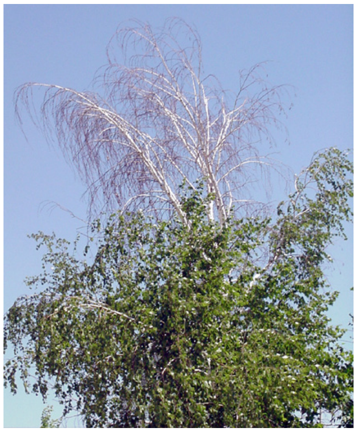
Bronze birch borer damage