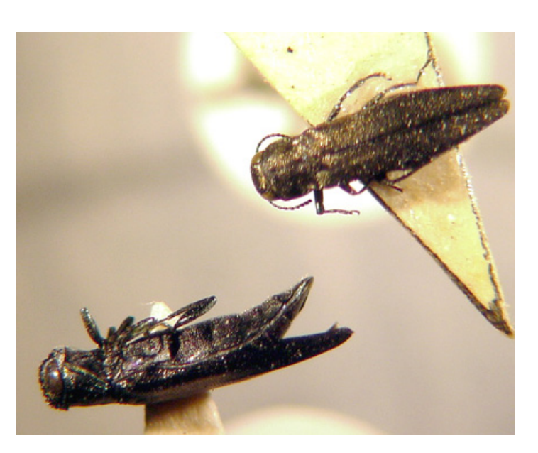
Bronze birch borer adults.

Systemic Insecticide Sprays: A soil drench of systemic insecticides can be used to kill adults that feed on leaves and larvae beneath the bark. Soil applications of imidacloprid (Bayer Tree and Shrub Protect I, Xytect and others) imidacloprid plus clothianidin (Bayer Tree and Shrub Protect II)can be made from between April 1 and May 15. Professionals can apply dinotefuran directly to the trunk or as a soil drench between May 1 and June 15.