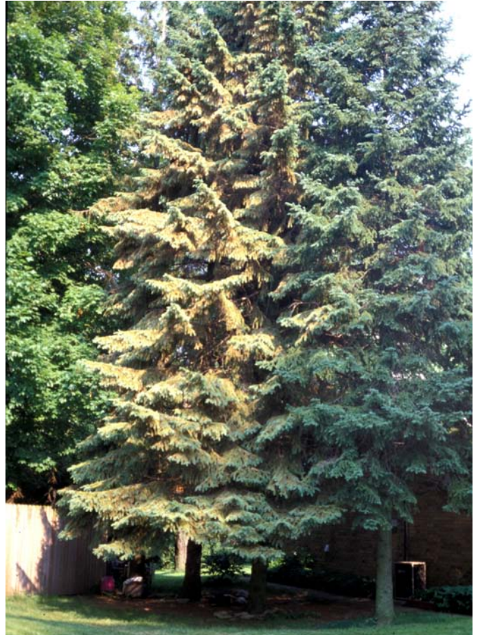
Twospotted spider mite injury on spruces

The natural enemies in your home garden are your most important weapons against spider mites. Reduce spider mite problems and conserve natural enemies in the home garden by using the least toxic materials available. Before selecting one of the materials on page 4, try to reduce your mite problem by hosing down your plants with a steady stream of water every 3 days for 9 days. If after 12 days you still find large numbers of mites on your plants, then choose one of the materials labeled for homeowners.