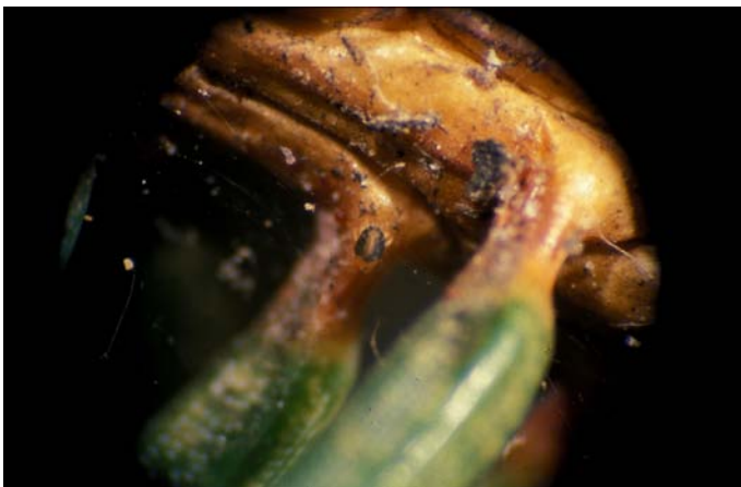
Twospotted spider mite