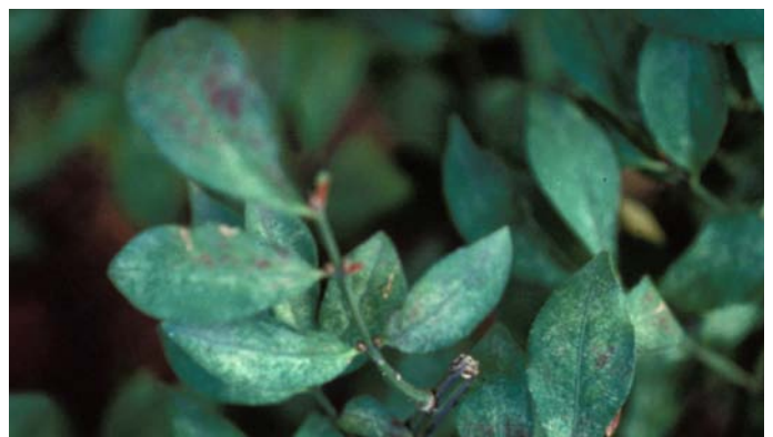
Twospotted spider mites on a burning bush