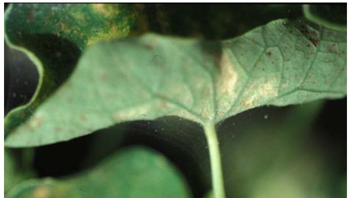
Twospotted spider mites crawling in their webs