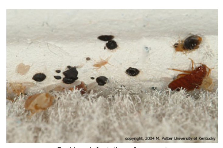
Bed bug infestation of a carpet

Humans can aid the dispersal of bed bugs from one structure to another via the movement of infested bedding, furniture, and packing materials. Even more widespread dispersal is associated with infested clothing, luggage, and perhaps lap top computers of travelers. International travelers from countries that have heavy bed bug infestations can be a source of bed bug infestations in hotel rooms, and there has been an increasing incidence of bed bugs in lodging establishments around the world, including in the U. S. Dependent only on a source of blood, bed bugs do not require unsanitary conditions characteristic of infestations of cockroaches. Bed bugs do not discriminate between economy or luxury hotel rooms, and they can exist in the cleanest hotels, motels, apartments, and homes.