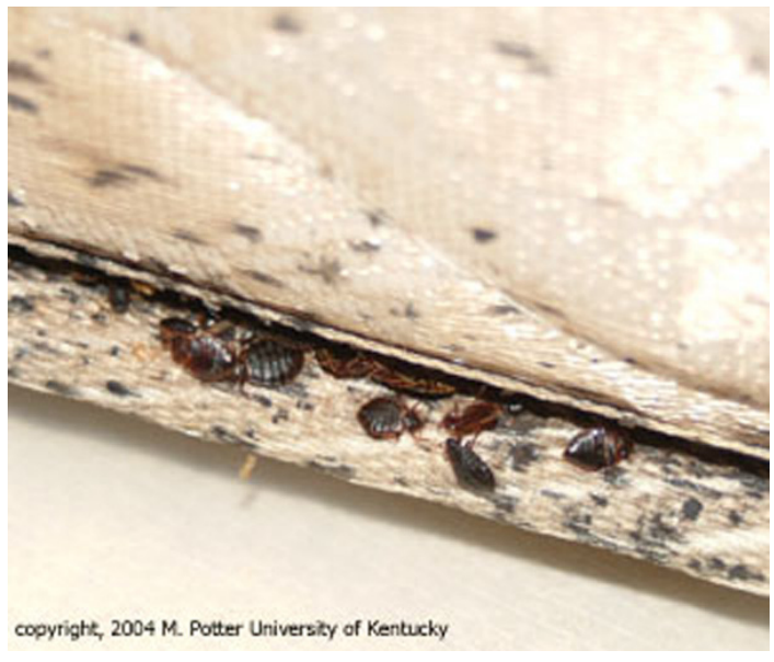
Bed bugs on a mattress seam