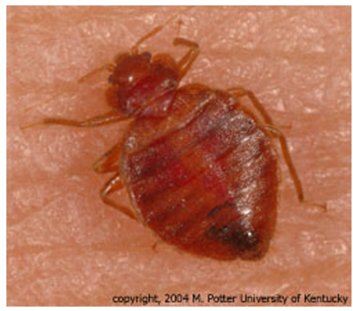
An adult bed bug, Cimex lectularius

At least 27 agents of human disease have been found in bed bugs, including viruses, bacteria, protozoa, and parasitic worms. None of these agents reproduce or multiply within bed bugs, and very few survive for any length of time inside a bed bug. There is no evidence that bed bugs are involved in the transmission (via bite or infected feces) of any disease agent, including hepatitis B virus and HIV, the virus that causes AIDS.