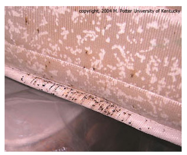
Bed bug infestation of a mattress