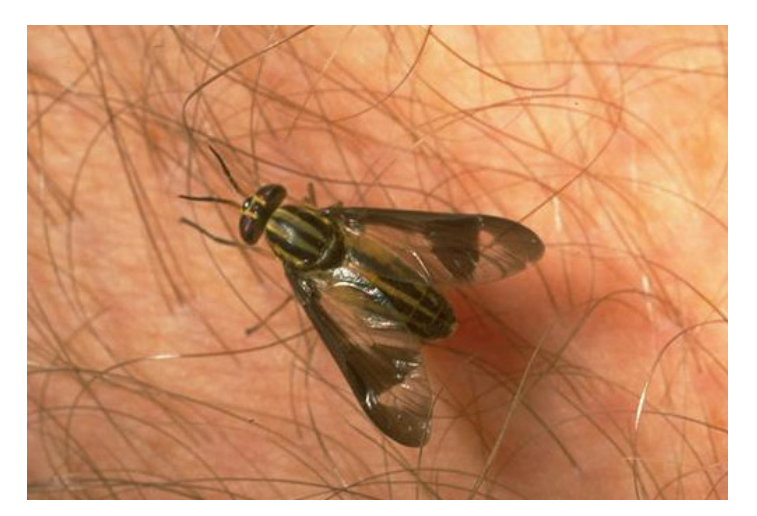
Figure 2. A deer fly, Chrysops sp. (Diptera: Tabanidae), adult female.