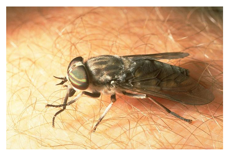
Figure 1. A horse fly, Tabanus sp. (Diptera: Tabanidae), adult female.