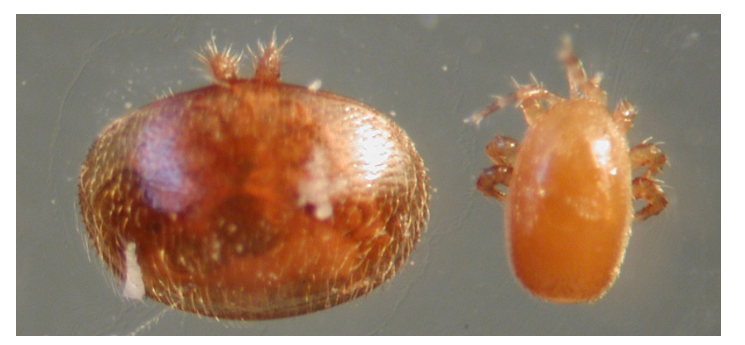
Figure 5. A Varroa mite on the left and a Tropilaelaps mite on the right.

Tropilaelaps feed and reproduce only on bee larvae in brood cells. They damage bees in a way that is similar to Varroa because they transmit viruses during feeding, such as deformed wing virus. Tropilaelaps are much smaller and can move much faster than Varroa (Figure 5). Their mouth parts are not large enough to allow them to feed on adult bees and these mites usually die within 3 days when no brood is present to feed on or to lay eggs upon. A break in the brood cycle occurs in temperate climates as the queen honey bee stops egg laying as winter approaches. Putting bees in a screen package without brood for 48 hours has been considered sufficient to rid the bees of Tropilaelaps. For these reasons Tropilaelaps is unlikely to become a major problem in the U.S., at least outside of Florida, where honey bees can have brood year-round. But Tropilaelaps mites have been found in South Korea and northern China, which have temperate climates. At this time, there is no reason for beekeepers in the Midwest to be concerned about this pest.