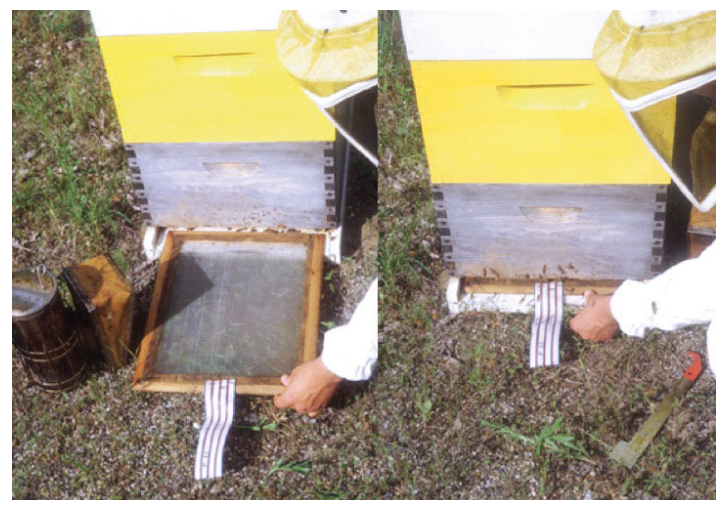
Figure 4. This beekeeper is inserting a homemade sticky board sampling device into a hive to monitor varroa mite populations.

The most sensitive method for detecting mites is to sample them with a "sticky board." Some hive boxes have screened bottom boards and a plastic sheet can be inserted after spraying it with vegetable oil. Or, you can construct a sticky board of three-eighths-inch-thick wooden frame with a screen stapled to it. Put contact paper on the bottom, spray vegetable oil on it, and insert it in the colony entrance (Figure 4). The screen prevents the bees from removing mites from the sheet.