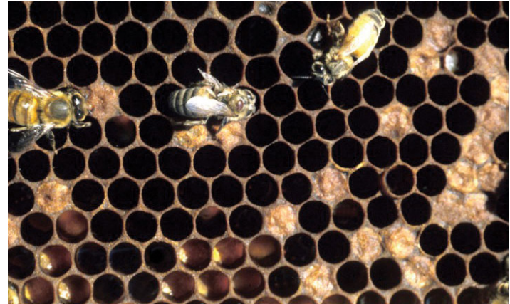
Figure 3. This photo shows symptoms of parasitic mite syndrome. Note the two worker bees with deformed wings and a mite on the bee in the center. The brood pattern is spotty because bees have removed dead larvae.

Typical symptoms include evidence of a number of virus and brood diseases, but sometimes the colony just dwindles