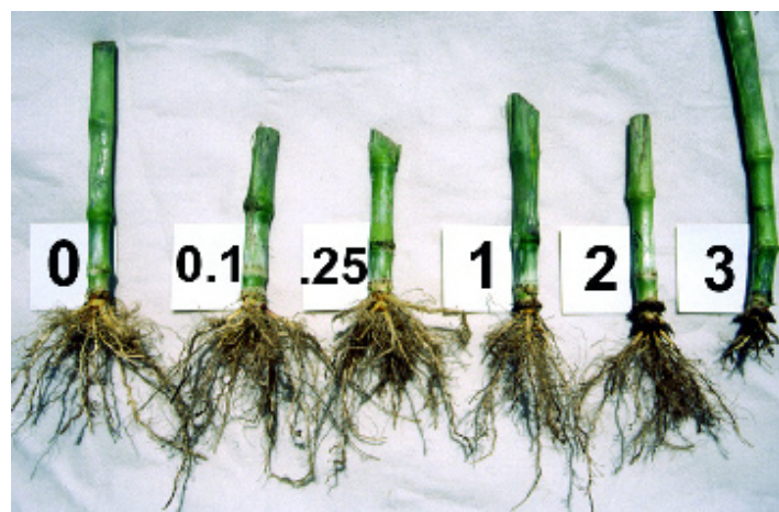
Nodal Root Rating Scale

Granular soil insecticides: Granular insecticides have long been considered the standard to which other rootworm control products are compared. They are not without their shortcomings – they are bulky, dusty and time-consuming to use. Though formulations and product names have changed over the last several years, the chemical classes have remained the same...organophosphates and synthetic pyrethroids. Insect resistance or enhanced biodegradation has not been an issue with the current registered products. There is a concern of product efficacy reductions when planting is very early in the season. SmartBox® technology was created to improve product placement, reduce worker exposure to insecticides, and lessen the product needed per acre by increasing the percentage of active ingredient. Calibration of products (Aztec 4.67G and Fortress 5G) is aided by a computerized tractor cab control module. Initially, there were problems with the distribution of insecticide – pulsating electronic solenoids caused irregular distribution of granuals. Simple fixes, such as springs inserted inside the distribution tubes, evened out most of the product’s flow and improved overall efficacy for rootworm control.