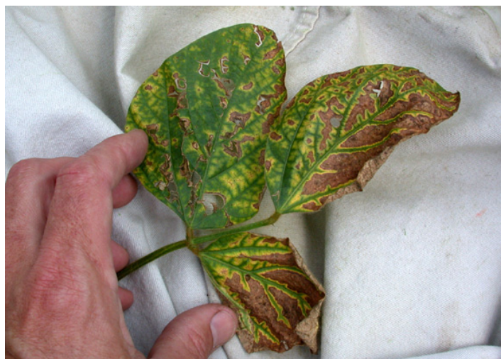
Figure 3. Advanced symptoms of SDS