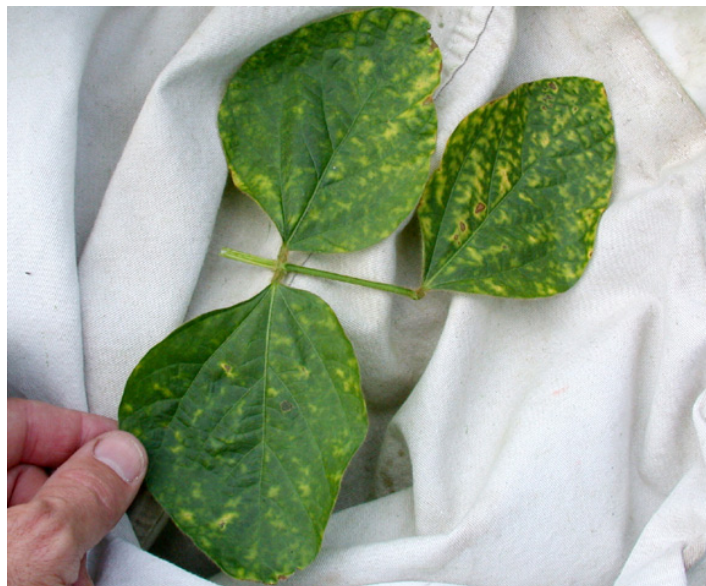
Figure 2. Early symptoms of SDS

Although Fusarium solani f. sp. glycines alone can cause SDS, there has long been an observed association between this disease and presence of the soybean cyst nematode in a field. Recent studies at Purdue have shown that symptoms become much more severe when both the fungus and the nematode are present in a field. If a field develops symptoms of SDS and the grower does not know that status of soybean cyst nematode in that field, soil should be tested to determine population levels of this pest.