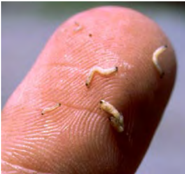
Different sizes of rootworm larvae

Insecticides applied after planting should be directed toward the base of the plant. It is also important to throw soil up around plants to incorporate the insecticide and promote the establishment of brace roots. A good brace root system will help prevent plant lodging and reduce yield losses due to rootworm feeding. If a no-till field has an economic population of larvae, placing the insecticide on top of the ground will usually not be effective. The only exception may be if the soil insecticide is watered in through irrigation or rainfall (ideally 1/2" or more). Two liquid soil insecticides, Furadan 4F and Lorsban 4E, are labeled for post-emergent applications. If one decides to mix the insecticide with a liquid nitrogen source for a side-dress application, compatibility checks should be made. Broadcasting the insecticide will greatly diminish rootworm efficacy.