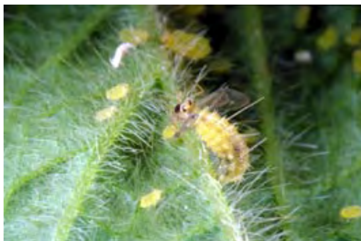
Tiny syrphid larva sucking a winged aphid dry

In summary, unless soybean fields are under extreme moisture stress, insecticides should not be applied for soybean aphid until the reproductive growth stages, and only after \geq 250 aphids/plant has been reached. Treatments below these levels and early in the growing season will likely only serve to necessitate a need for second insecticide application later in the season. Happy scouting!