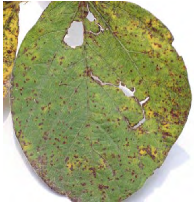
Figure 3. Early brown spot lesions. Note that some of these spots have a yellow border, but others do not. The ones without a yellow border would be very difficult to distinguish from soybean rust at this stage.

The major rust look-alike disease that will likely be seen on lower leaves of soybean is brown spot. When lesions of this disease are fully developed, they look quite different from soybean rust pustules (Fig. 3). However, when brown spot lesions are first developing, they are small, dark purple lesions that could be mistaken for a rust infection that has not yet matured into a pustule (Fig. 4). Because of the dry and cool weather during late May and early June, there is less brown spot on soybean leaves than usual. Soybeans that were planted early show brown spot on the unifoliolate leaves and lower trifoliolates, but later plantings are not yet showing brown spot symptoms.