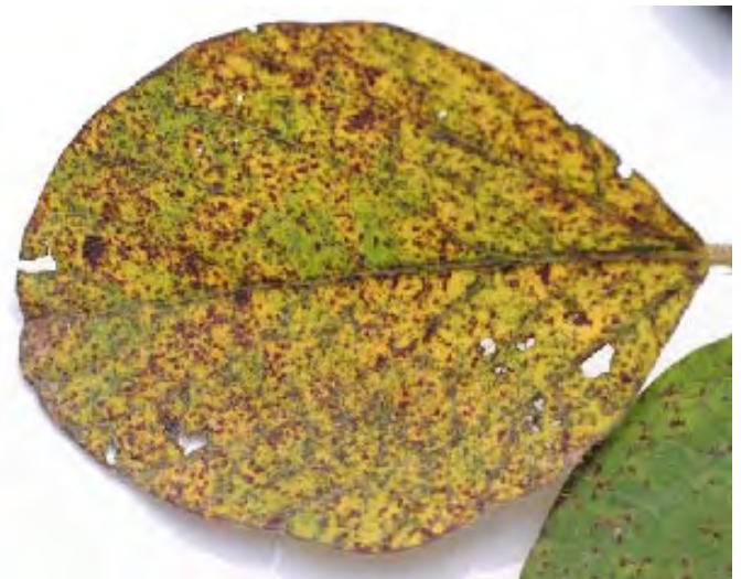
Figure 4. When brown spot lesions mature and become more numerous, the leaf becomes generally yellow and necrotic areas become larger, as lesions coalesce. At this stage, brown spot can be readily distinguished from rust.