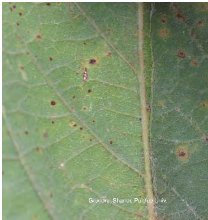
Figure 1. The leaf shows early symptoms of Asian soybean rust. The infection sites are small, dark spots with no yellow border. The larger dark spots with a distinct yellow halo are probably bacterial blight.

abundant on the pustule, the pustule itself is visible as a conical protrusion with a small hole at the apex. Before the rust infection has progressed to the development of a mature pustule, it is much more difficult to make a diagnosis. Initially, rust infections appear as small dark spots (Fig. 2). Spots such as these could result from several causes. Leaves with suspicious spots can be put in a plastic bag with a damp paper towel. Inflate the bag by blowing into it, and then tie the top. Allow the leaves to incubate for a couple of days at room temperature, out of direct sunlight. If the lesions are the result of rust, pustules will develop.