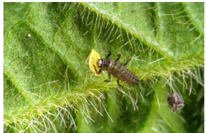
Newly hatch ladybeetle larva feeding on soybean aphid

The economic threshold is 250 or more aphids per plant. Very few trials have been conducted in treating vegetative soybean for aphids at or below 250/plant, that data shows NO yield response. Aphid numbers of 20-30/plant is extremely low, and is not a certain indicator of economic populations later in the season. Furthermore, predators and parasites