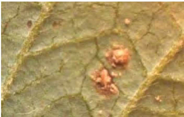
Figure 2. Close-up view of a soybean rust pustule. The pustule is erumpent and is covered with spores of the fungus.

abundant on the pustule, the pustule itself is visible as a conical protrusion with a small hole at the apex. Before the rust infection has progressed to the development of a mature pustule, it is much more difficult to make a diagnosis. Initially, rust infections appear as small dark spots (Fig. 2). Spots such as these could result from several causes. Leaves with suspicious spots can be put in a plastic bag with a damp paper towel. Inflate the bag by blowing into it, and then tie the top. Allow the leaves to incubate for a couple of days at room temperature, out of direct sunlight. If the lesions are the result of rust, pustules will develop.