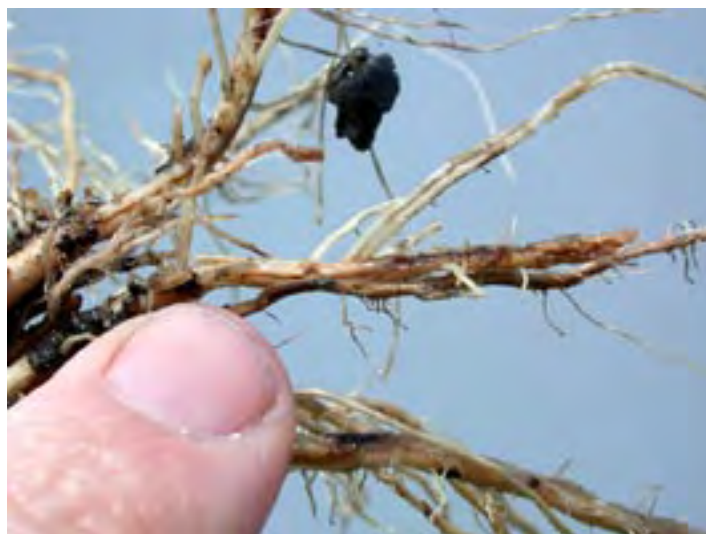
Rootworm scarring and tunneling from early feeding

Rootworm larvae have been hatching and seeking corn roots for over two weeks in northern counties and three or more weeks in southern counties. When first hatched the larvae are very small and live mostly within the roots. As they increase in size, so does their appetite. They will feed both inside and outside of the roots, causing tunneling and pruning. In our monitoring of soybean fields last season, we detected a large number of rootworm beetles especially in northern and central counties. It would be wise to sample roots of plants in these high-risk fields, especially where insecticide efficacy is in question (refer to Pest&Crop #9, 2005, “Early Planting and Rootworm Insecticide Efficacy”).