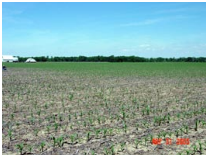
View of damaged area of field

Though this field diagnosis doesn’t have a happy ending, the agronomist’s experience and skills have been increased. Their new gained knowledge of possible causes for these field symptoms will be useful in the future. Happy Scouting!