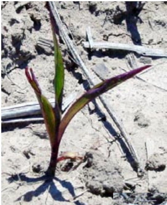
Stunted and discolored plants (above) damaged root system (left)