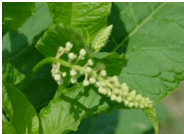
Developing fruit June 8th