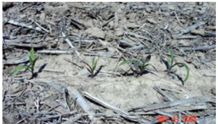
Wilted and purplish plants