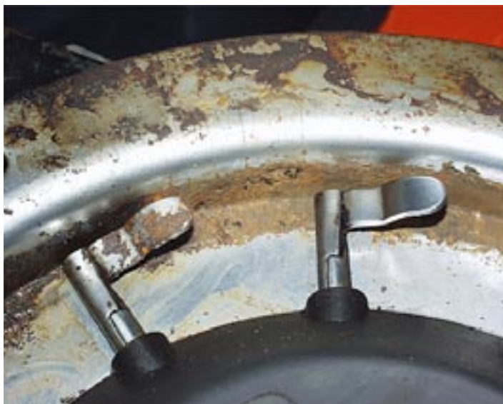
John Deere back plate