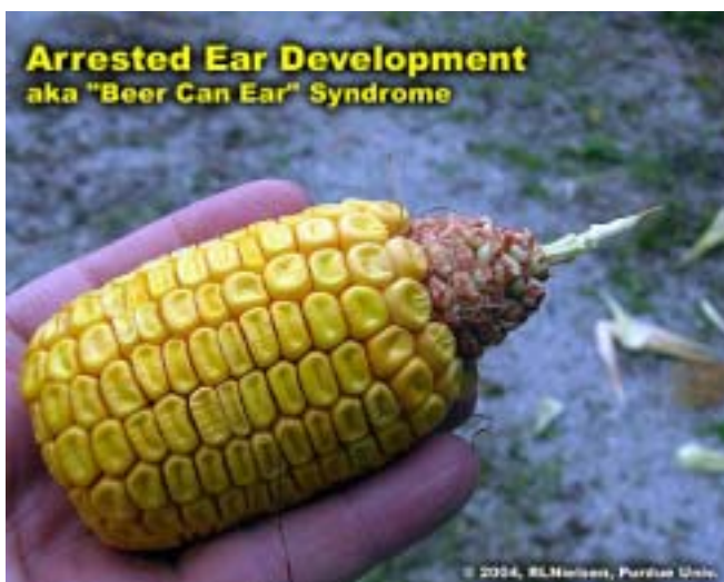
Arrested ear exhibiting "bony" cob structure and rudimentary ear shoot at tip of ear.