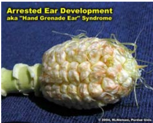
Classical symptom of "hand grenade" ear symptom.