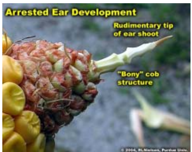
Closer view of "bony" cob structure and rudimentary ear shoot at tip of ear.