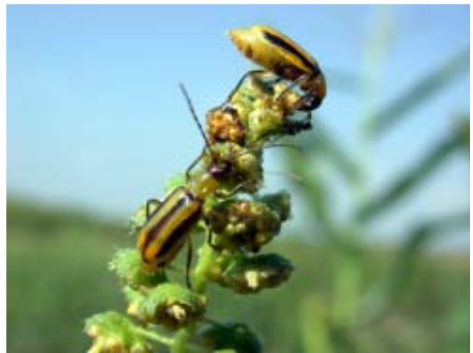
Western corn rootworm beetles feeding on weed pollen

We continue to receive reports about various situations that have attracted tremendous numbers of western corn rootworm beetles. This includes late-planted/replanted corn and weed escapes through the soybean canopy. Remember, the rootworm beetles are pollen feeders, and not just corn pollen (e.g., foxtails, ragweeds, lambsquarters, pigweeds, etc.). Numerous beetles that converge on these "trap" crops will likely encourage significant egg laying for next year's corn roots. Investigations of these areas during August will help one make informed decisions for next year, i.e., rootworm insecticides.