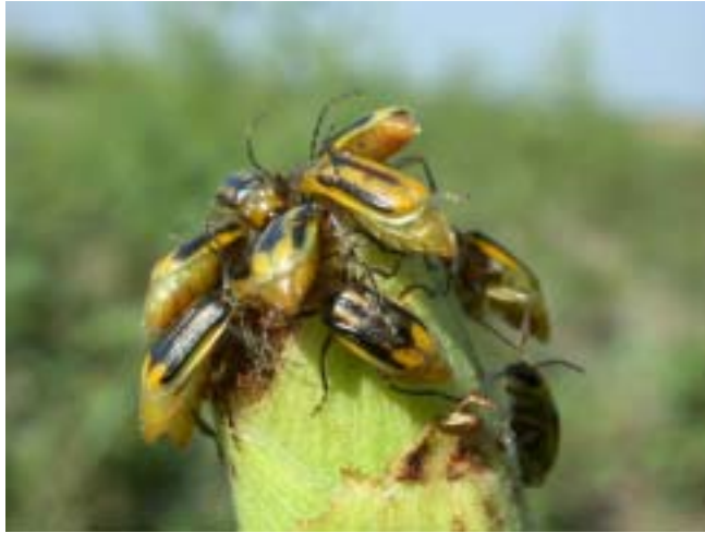
Beetles demolishing silks of late-planted corn

egg-laying than previous years may be occurring for a given area of the state. This was reported in last week's Pest&Crop concerning west central Indiana counties south of Interstate 70. We continue to encourage pest managers to observe for the beetle's presence in their soybean fields, and not rely solely on our county sweep survey for next year's insect management decisions.