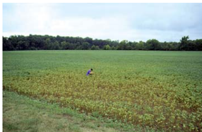
Spider mite damage starting from the field edge

Stressed plants actually provide a better nutritional feast for spider mites thus they thrive and quickly colonize areas or whole fields. The best spider mite