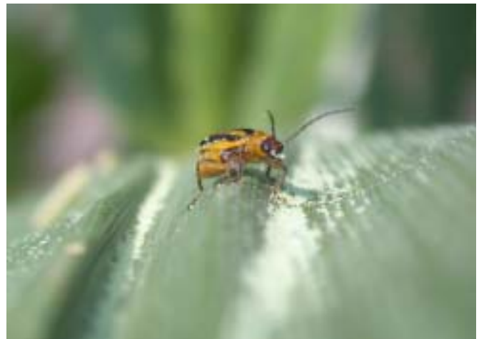
Western corn rootworm beetle feeding on pollen

Research with inbreds in seed production fields has shown that 2 to 3 rootworm beetles per plant can