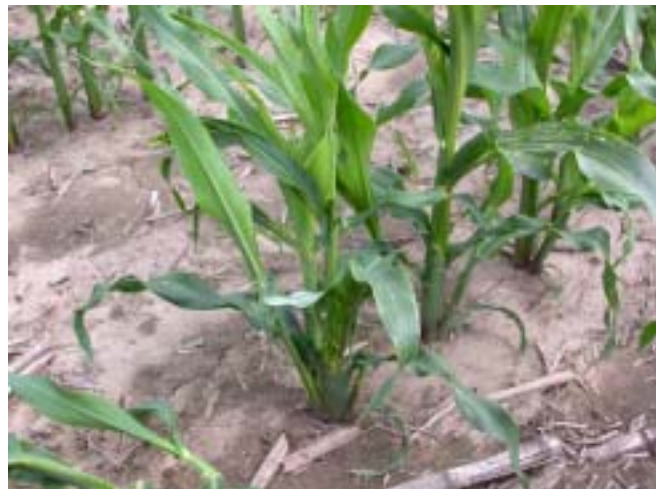
Stunted and suckered plant