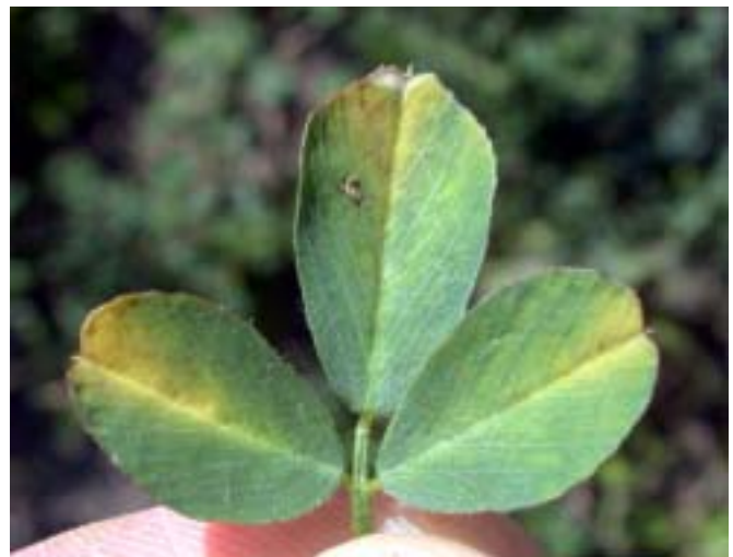
Hopper burn on alfalfa

Potato leafhoppers are small, wedge-shaped, yellowish-green insects that remove plant sap with their piercing-sucking mouthparts. Leafhopper feeding will often cause the characteristic wedge-shaped yellow area at the leaf tip, which is referred to as "hopper burn." Widespread feeding damage can cause a field to appear yellow throughout. Leafhopper damage reduces yield and forage quality through a loss of protein. If left uncontrolled for several cuttings, potato leafhoppers can also significantly reduce stands.