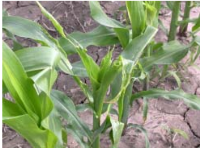
Symptoms on younger corn leaves

Though this damage has been seen in many cornfields, it is a small number of plants (maybe 2-3%) scattered throughout the field. Several field agronomists and extension specialists are stumped. If you are seeing similar damage, refer to pictures below, we'd like to hear from you. Please call 765-494-4563 and let us know.