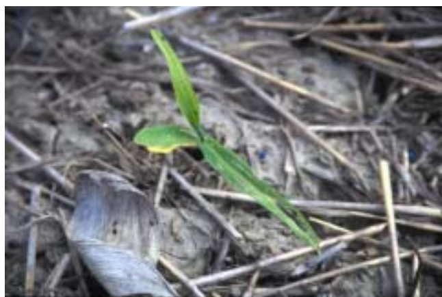
Slug damage to corn and bait pellets

Where replanting is necessary from slug damage, one should strongly consider tilling (disc and/or field cultivator) the area first. This should help dry the area and break-up and bury crop residue. Doing so will discourage further slug activity. Granular and liquid insecticides are ineffective against slugs, as they slime over them. Home remedies, such as spraying plants at night with liquid fertilizer (high salt concentration), have proven futile.