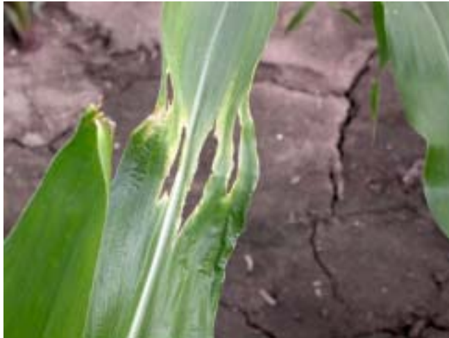
Elongated, transverse holes