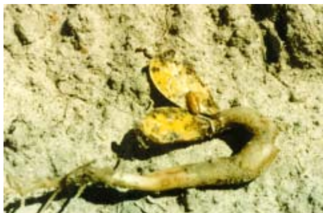
Seedcorn maggot pupa on damaged seedling

When replanting, it is possible yet unlikely, that the maggots will damage the newly planted seed. Finding small, light brown, oval pupa cases during your inspection indicates that the maggots are nearing completion of their life cycle and the damage is done. Also, light tillage before replanting should expose and kill many maggots. If one wants to be certain of no further damage, a seed treatment (e.g., Kernel Guard Supreme) may be applied at planting.