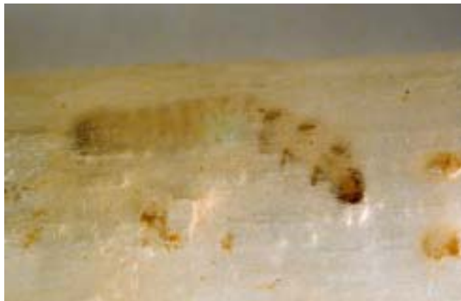
Early instar rootworm inside root

rootworm larvae. Small (1/8 to 1/2 inch in length), slender, white larvae with brown head and tail sections. More on this sampling will be in a future issue of the Pest&Crop .