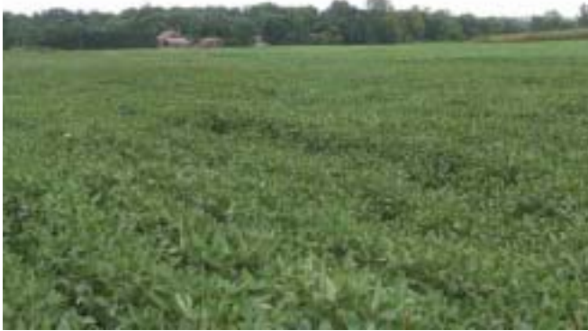
Fig. 1. Soybean field. Note the “wavy” uneven plant canopy height.