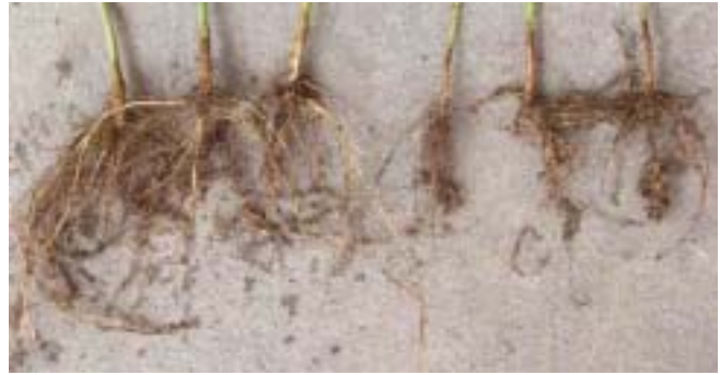
Fig 2. Soybean roots. Healthy roots with copious Rhizobium nodules on the left, and root knot nematode induced galling on the right.