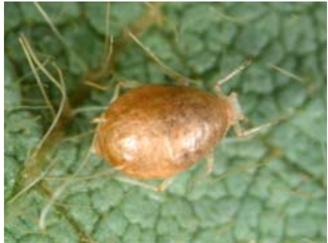
Parasitized aphid "mummy"

Treating soybean with an insecticide for the remainder of the season may tip the balance in the favor of soybean aphid. In other words, natural enemies recover slowly from broad-spectrum insecticides compared to aphids. In general, toxic levels of insecticide are absorbed by ingestion (eating treated leaves) and/or contact (walking over treated areas). Aphids are sucking insects and ingest only internal plant fluids. As well, except for mature females, they are relatively stationary on the bottom sides of leaves; obviously a difficult location to get thorough coverage. A very important note is that surviving aphids can repopulate fields at break-neck speed, certainly outpacing natural enemies.