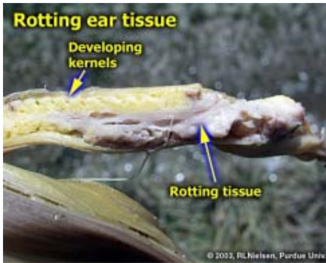
Rotting kernel/cob tissue.