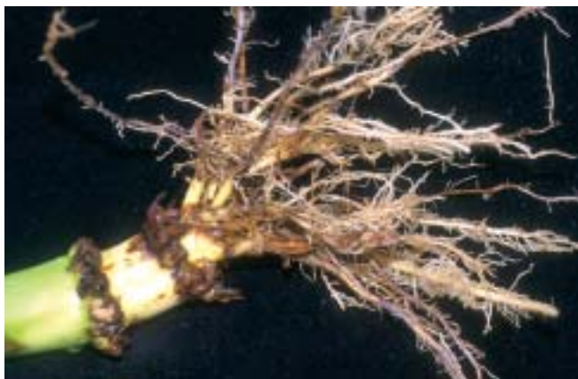
WCR damaged roots