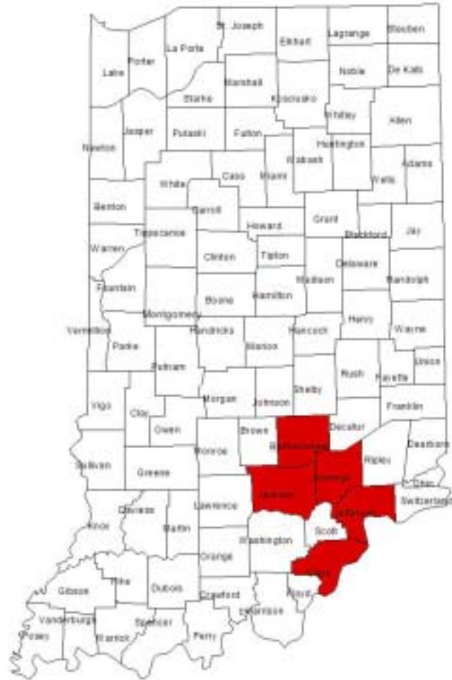
Figure 1. Indiana counties with confirmed cases of glyphosate-resistant marestail.

Indiana's problem has been isolated to the southern portion of Indiana and was first reported in 2002 (Figure 1). Two populations of marestail were collected from fields in Jackson County in the fall of 2002 and were subsequently tested for glyphosate-resistance in the greenhouse. Both Jackson County populations were tolerant to glyphosate applied at rates as high as 4x the