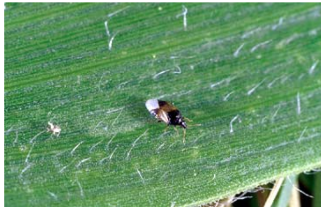
Minute pirate bug on a corn leaf

Soybean plants may be looking yellow and puny, but the soybean aphid doesn't seem to mind. Research fields in northern Indiana, along U.S. 30, have had a dramatic increase in aphid numbers over the past week. In these fields, 100% of the plants sampled had on average 14-30 aphids/plant. Winged aphids were present, indicating that they are moving to other locations. This