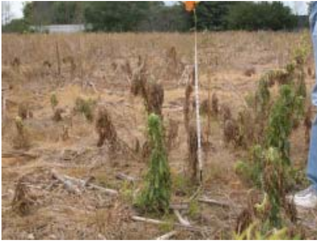
Figure 3. Typical field in which resistant marestail is continuing to growing while susceptible plants that were the same size at the time of application are dead.