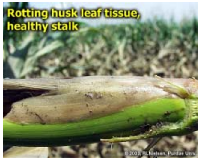
Rotting husk leaf tissue near connection of ear shank to stalk node.