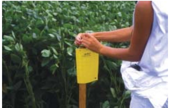
Placing sticky trap on stake

fields for WCR beetles and treat the following year’s corn only if significant beetle numbers are found in soybean. Using IPM practices (i.e., scouting and thresholds) as part of a management program will provide reliable information that can be used to make WCR management decisions. Pherocon® AM yellow sticky traps placed on stakes in a soybean field is a passive method for sampling WCR beetles. There are no lures (pheromone or food) on these traps. WCR beetles are attracted to the bright yellow traps and become entangled in the sticky surface.