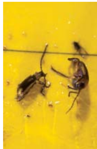
Two captured WCR beetles

A week's catch, which will include many other insects and debris