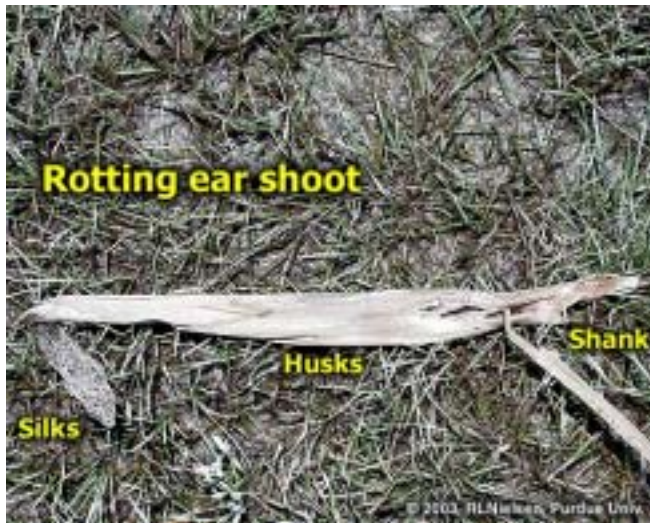
Entire rotting ear shoot.