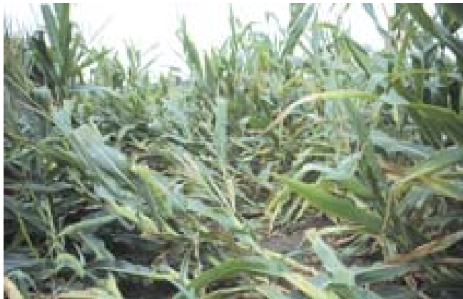
Lodging from WCR root feeding

Portions of northern Indiana have been affected by a dramatic change in western corn rootworm (WCR) beetle behavior. Previously, WCR adults laid eggs primarily in cornfields, but now variant WCR are laying large numbers of eggs in soybean fields, resulting in economic root damage to corn the following growing season. This behavioral change has virtually eliminated the benefit of crop rotation as a rootworm management tactic in the most severely affected regions of the problem area and has resulted in routine applications of soil insecticides to most cornfields.