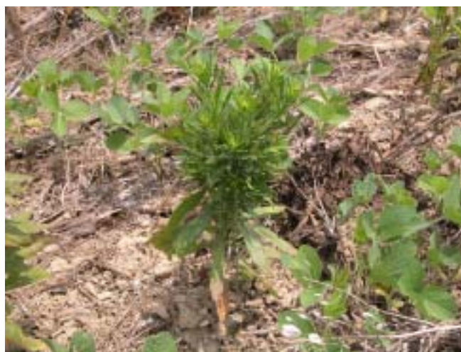
Figure 2. Marestail plant surviving after herbicide application has killed the growing point. Note the extensive branching and multiple growing points.

c. Often glyphosate-resistant and susceptible plants can be found beside each other and interspersed throughout a field (Figures 3 and 4). If marestail growth was uniform and most of the plants were the same size at the time of application then surviving plants in the midst of dead marestail should be considered resistant.