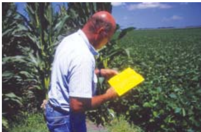
Producer counting WCR beetles on trap

Each week for 6 weeks, or until the beetle threshold is reached, remove the traps, and place new ones just above the soybean canopy. Count and record the number of rootworm beetles on each trap. To determine the average number of beetles/trap/day, add the numbers for the 6 traps in each field, divide that number by 6, and then divide by the number of days the traps have been in the field. Although a 7-day sampling period is preferred, be sure to divide by the actual number of days the traps were in the field to determine the average.