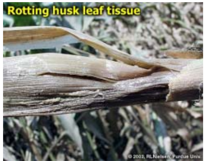
Rotting husk leaf tissue near connection of ear shank to stalk node.