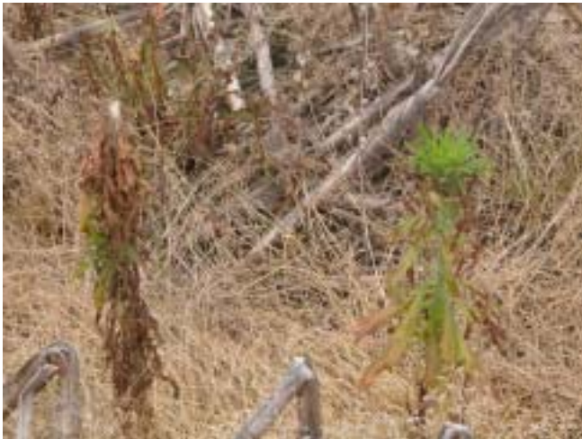
Figure 4. The susceptible plant on the left is dying following glyphosate application. the potential resistant plant on the right was initially stunted and displayed some yellowing but the new growth appears healthy and normal.