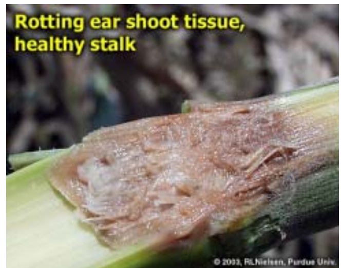
Rotting ear shank tissue at point of connection to stalk node.