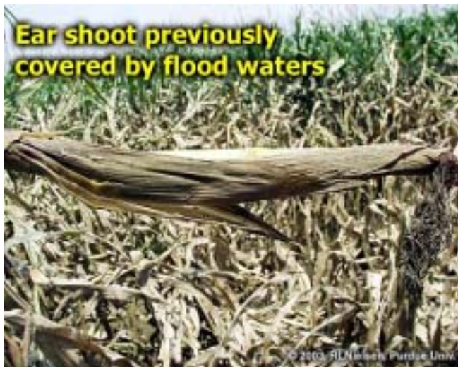
Bacterial ear rot following immersion of ear shoot by flood waters.