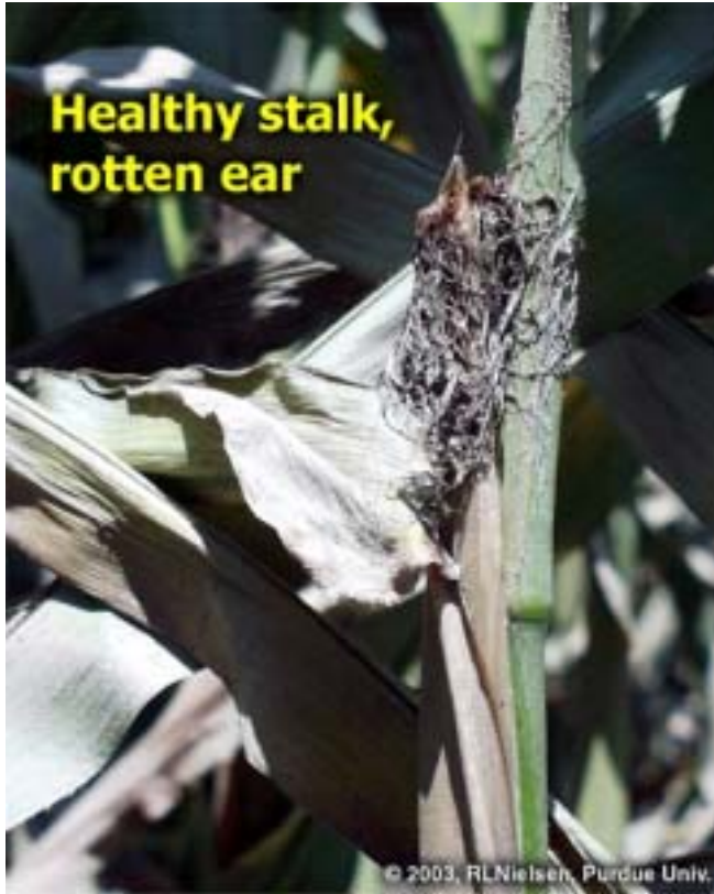
Mud-covered ear shoot.

For other Corny News Network articles, browse through the CNN Archives at < http://www.kingcorn.org/news/index-cnn.html >. For other information about corn, take a look at the Corn Growers' Guidebook at < http://www.kingcorn.org >.