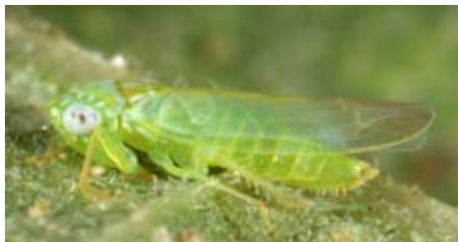
Close-up of an adult potato leafhopper

Producers are encouraged to inspect new growth soon after cutting for potato leafhopper; this is when alfalfa is most susceptible to feeding, leading to reduced yields and protein levels. Remember, once yellowing or "hopper burn" is seen, the damage has already been done. Refer to Pest&Crop #12 , for sampling and management guidelines. For recommended insecticides, see E-220, Alfalfa Insect Control Recommendations - 2003 . This and other field crop related publications can be viewed electronically at < http://www.entm.purdue.edu/entomology/ext/targets/e-series/fieldcro.htm >.