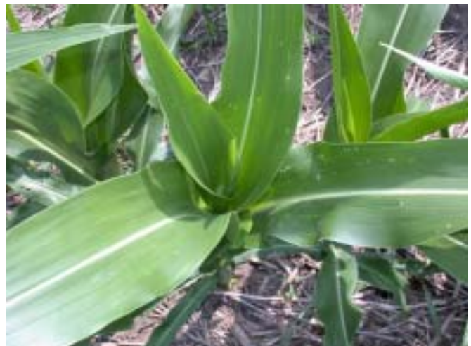
Shot hole damage in corn whorl

damage to determine the percentage of damaged plants. Also, determine if borers are still present and actively feeding. Pull out, carefully unroll, and examine the whorl leaves from one plant showing damage in each sample set, for a maximum of 5 plants in the entire field. Total the number of live borers found and determine the average number of borers per plant.