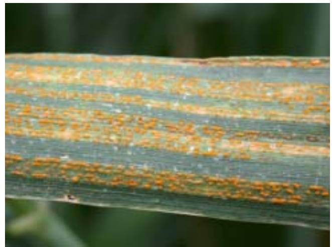
Close-up of stripe rust of wheat leaf

Earlier, stripe rust was thriving in many wheat fields. This is a rust that normally does not appear in the Midwest. The cool, wet weather of May provided ideal conditions for this rust, and it has shown up in many wheat fields, but not to such extent as to cause serious reduction of yield or test weight. With the arrival of warm weather, the stripe rust lesions are drying up.