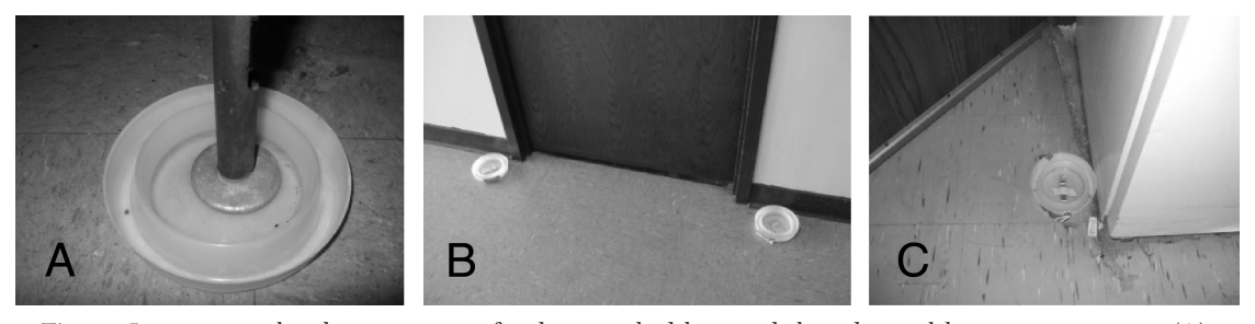
Fig. 1. Interceptors placed in apartments for detecting bed bugs and their dispersal between apartments: (A) an interceptor under a bed leg, (B) two interceptors in the hallway beside an apartment door, and (C) an interceptor behind the entry door.

ing managers, staff, and the pest control provider implemented both nonchemical and chemical tools to manage the bed bugs. In addition, chemical (Wang et al. 2007) and integrated pest management (IPM) (Wang et al. 2009a) programs were implemented by researchers from Purdue University. Yet, many infested apartments were always present in the building. As a part of our long-term goal of developing more effective and sustainable bed bug management programs, we investigated the characteristics of bed bug infestation and dispersal in the building during December 2008-April 2009. We attempted to answer the following questions: What factors contributed to the spread of bed bugs? How often do bed bugs disperse from infested apartments? How effective is the bed bug control program currently in place?