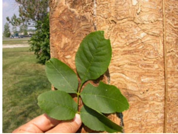
Leaves of an Ash tree